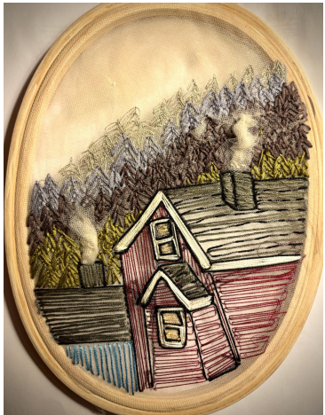
A Stitch in Time: Embroidery by Kirsa Hughes-Skandijs Exhibition Dates: Through December 20th, 2025

A Stitch in Time is a fiber art exhibition of embroidery pieces depicting a broad array of the everyday sights of our city's streets juxtaposed with the natural sights of our shores and trails. The exhibition aims to examine our local surroundings and the "footprints" we leave on the timeless rainforest that offers refuge to humans and pets. Artist Kirsa Hughes-Skandijs says, "I find centering the medium of needle and thread especially apt as our individual lives are woven together by daily life here, rooted in the springy soil under the spruce boughs."