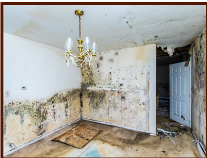
Home with major damage