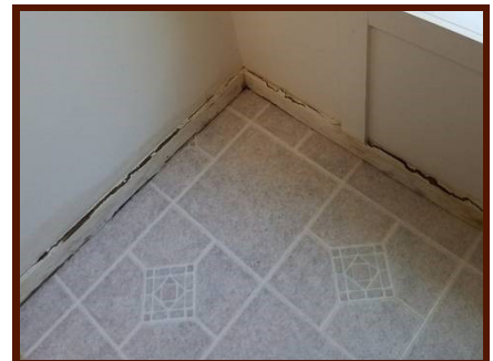
Minor water damage