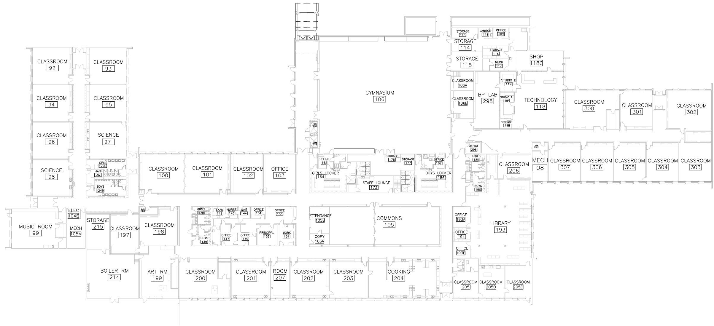
FLOOR PLAN 75,486 SF