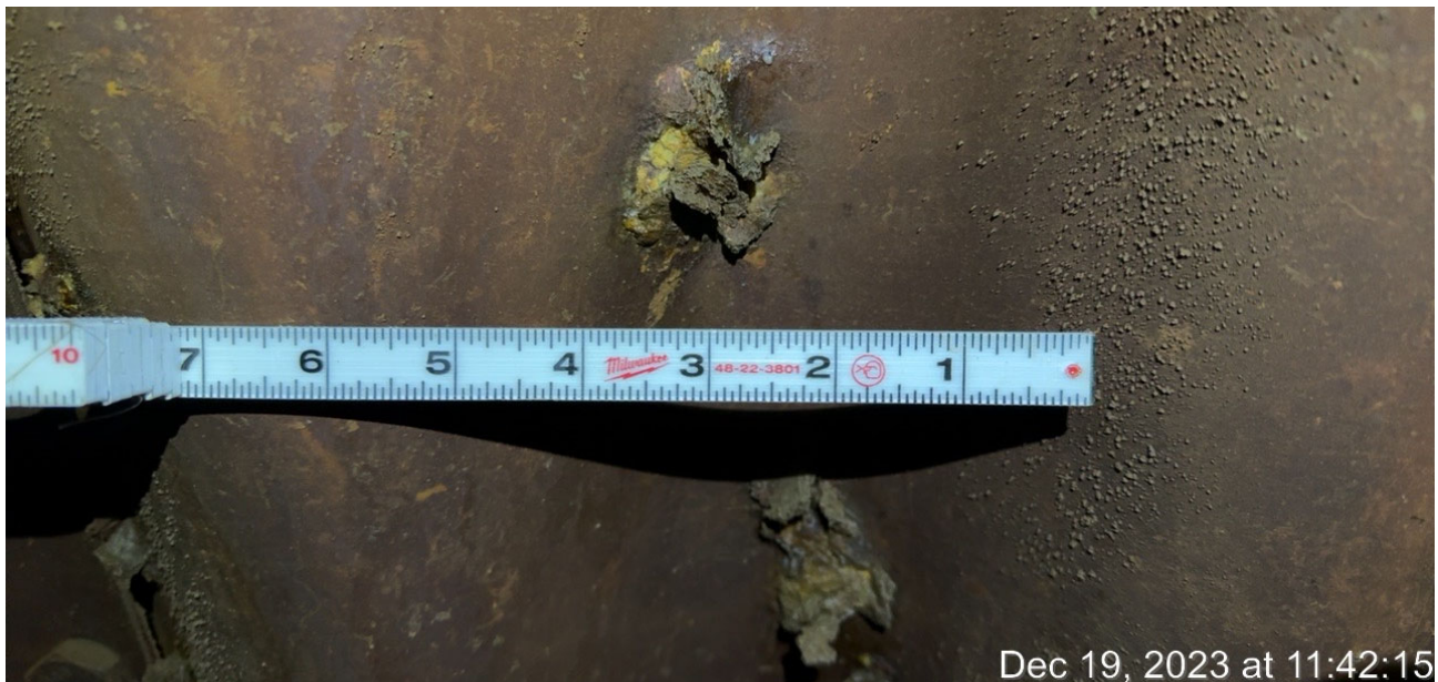
Photo 02: Holes in the culvert sidewall measure an inch in diameter or more.