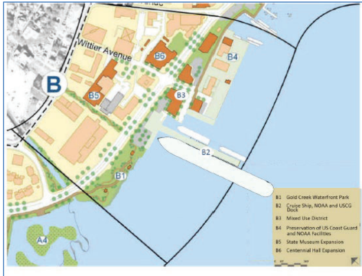
Figure 33: Area B (Overall) 2025 Concept Plan

Page 47. Repeal and replace Figure 33: Area B (Overall) 2025 Concept Plan as follows: