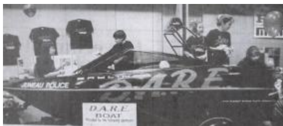
March 5, 1993 – JPD unveiled its second DARE vehicle at the annual Rotary Club Boat Show; a donated 17 foot Bayliner speedboat painted black with a bright red and white DARE slogans on it.

March 3, 1993 – The Juneau Gun Club and its caretaker were “busted” for selling alcohol without a license.