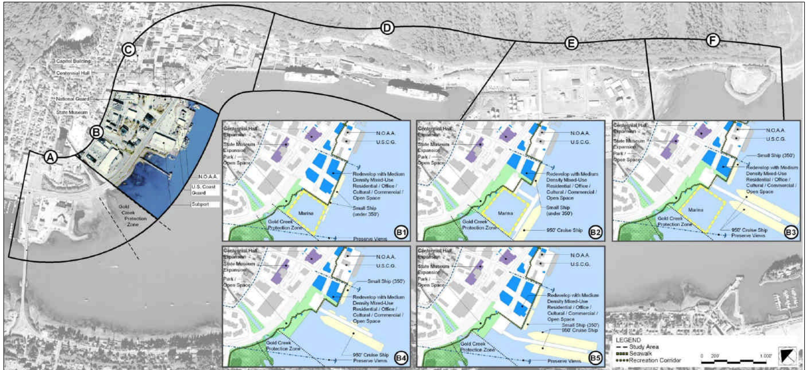
Figure 23: Area B (Support) Alternative Concepts

Alternatives prepared for the Support redevelopment area contemplate similar upland organization as illustrated in the Draft 2003 Support Vicinity Revitalization Plan coupled with waterside development schemes ranging from a marina to a twin cruise ship pier. Each alternative presents a large public park and recreation area east of Gold Creek and preservation of operations found at the U.S. Coast Guard and NOAA facilities.