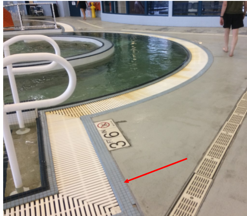
TYPICAL DECK DRAINS. NOTE 1" x 1" TILE COPING EDGE IN LIGHT BLUE.