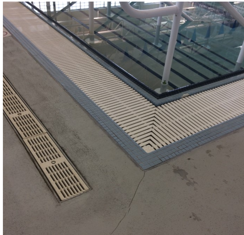
DECK PERIMETER DRAIN DETAILS- TYPICAL