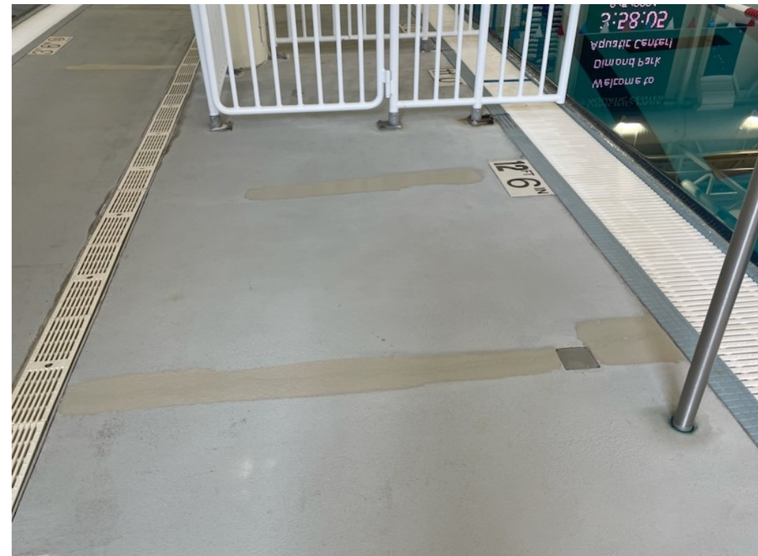
PHOTO AFTER REPAIRS.