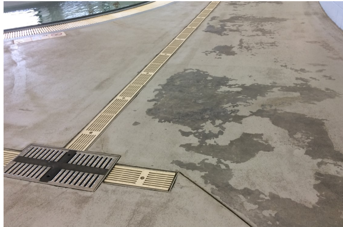
TRANSITION PIECES WILL BE INSTALLED AT ALL DRAIN LOCATIONS. NOTE: FLAKED GRAY CONCRETE PAINT.