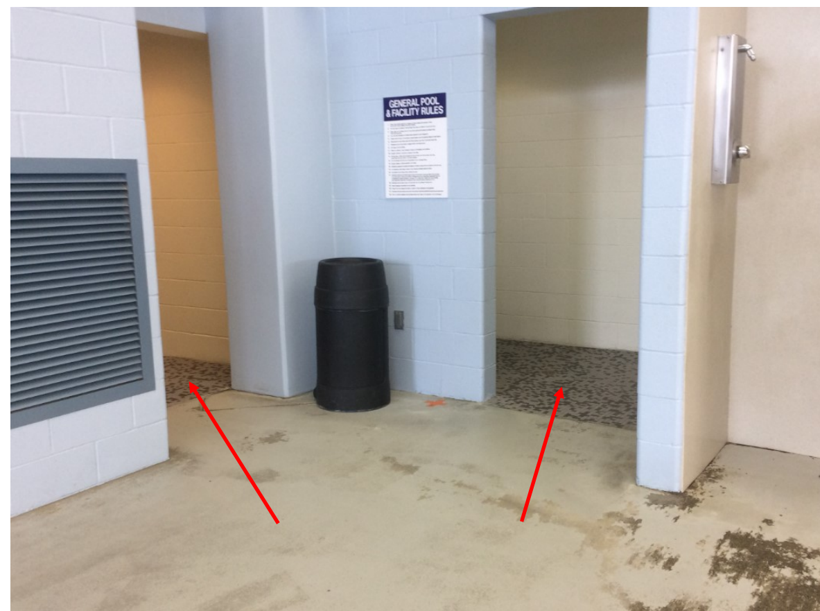
TILE AT LOCKER ROOM ENTRIES TO REMAIN WITH TRANSITION STRIPS ONTO NEW LIFEFLOOR