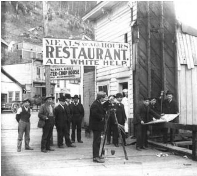
March 18, 1906 – The Louvre Theater on Front Street following a fire.

-The City Marshal was required to furnish a bond in the sum of one thousand dollars for the faithful performance of his duties and safe delivery of all public monies that came into his possession.