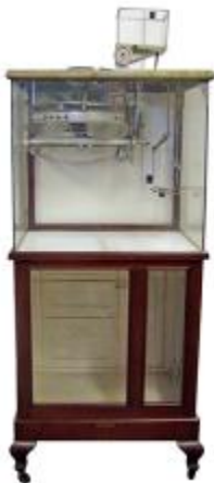
Original gasoline fed popcorn machine