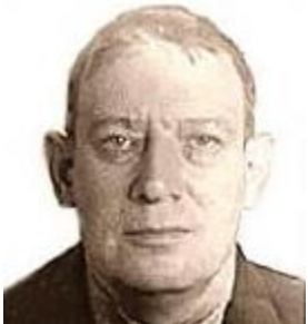
Robert Stroud – “The Birdman”