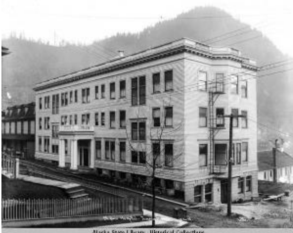
St. Ann's Hospital