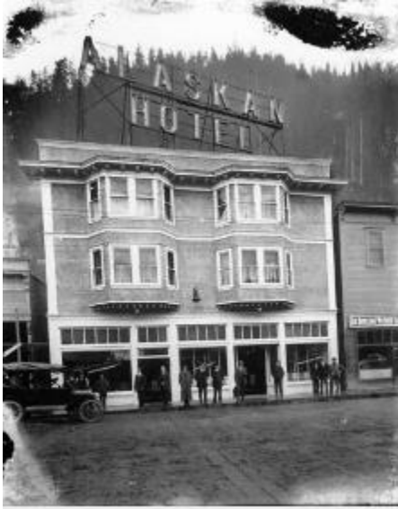
Alaska State Library - Historical Collections

Photos from the Alaska State Library-Historical Collections