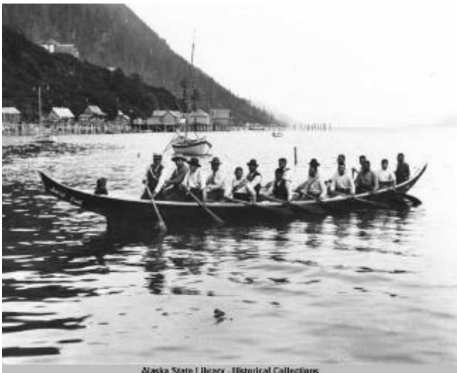
Dugout Canoe at AUK Village

March 19, 1901 – The Marshal was instructed to notify the Franklin Hotel, the New York Restaurant, the Nevada Restaurant and others to stop dumping garbage on the beach and to file a complaint in the Police Court against those who did not comply.