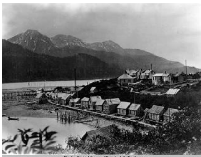
AUK Indian Village