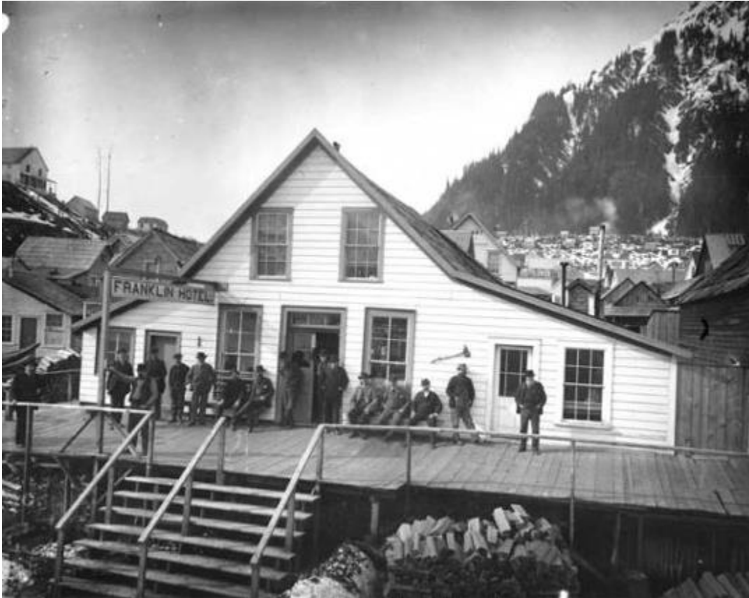
Juneau's First Hotel – The Franklin Hotel