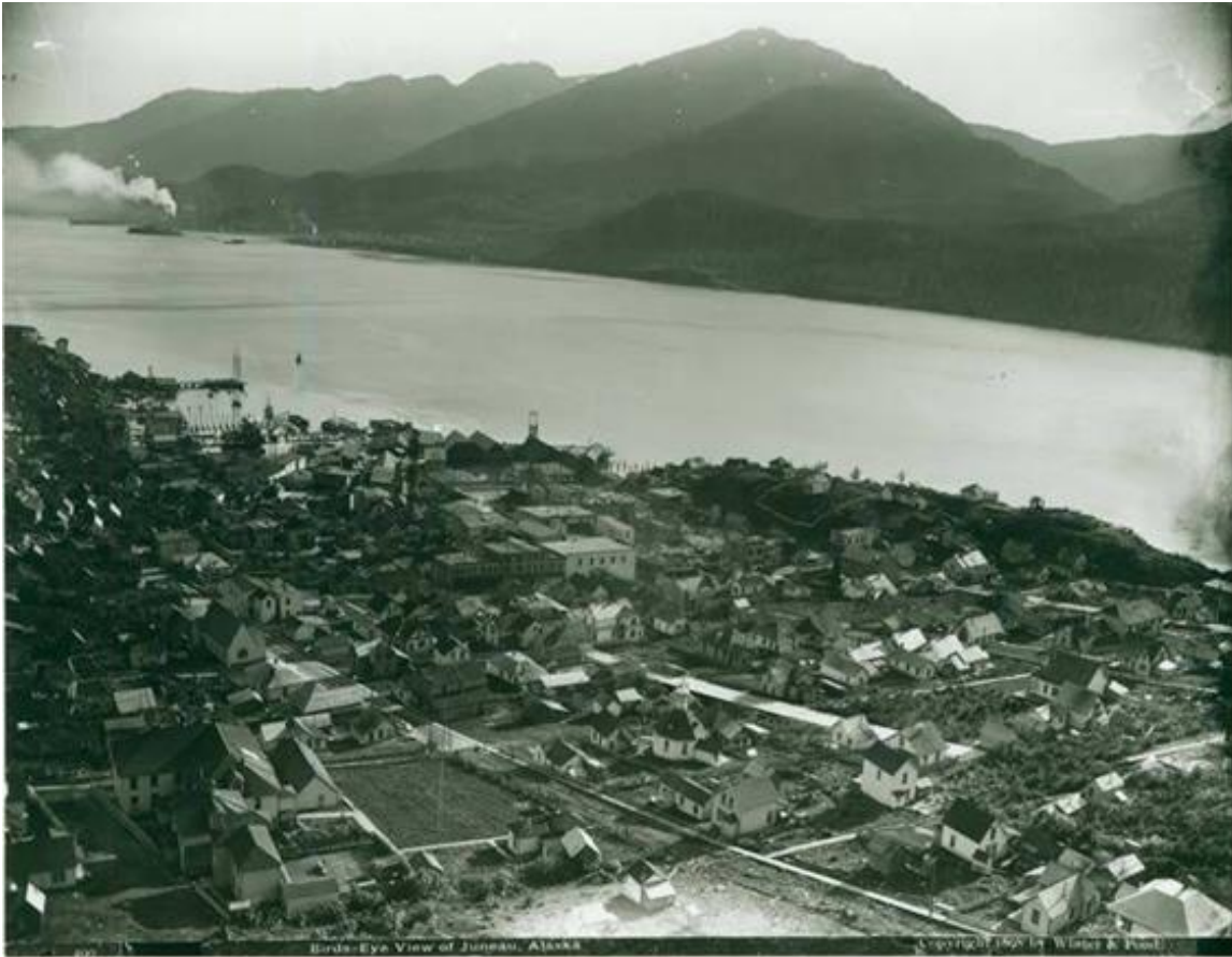
Alaska State Library - Historical Collections

Photos from the Alaska State Library-Historical Collections