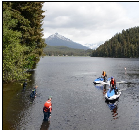
Students participate in a personal watercraft safety class at Auke Lake in June 2014.

With your help we can protect and preserve the qualities that draw us to the lake: clean water, clean air, healthy habitat for wildlife and fish, and opportunities for all kinds of recreation.