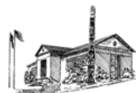
Juneau-Douglas City Museum