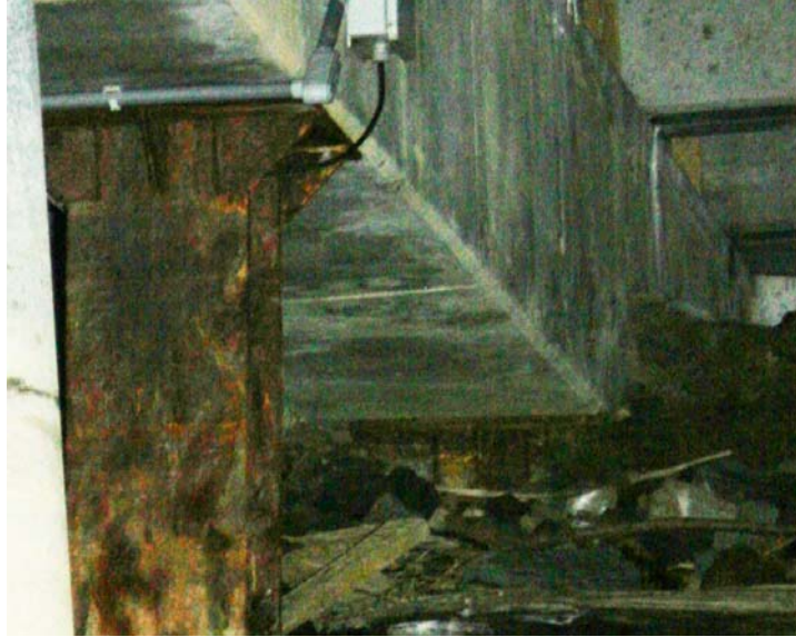
E.5 Line from Southwest