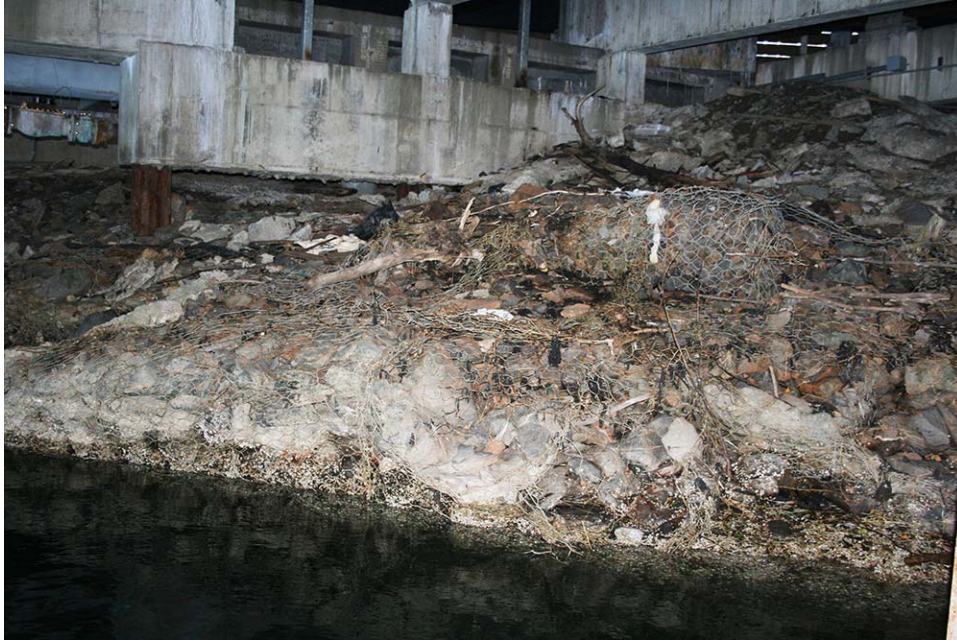
D Line, Piles 9 & 10 from Southwest (Note Gabions)