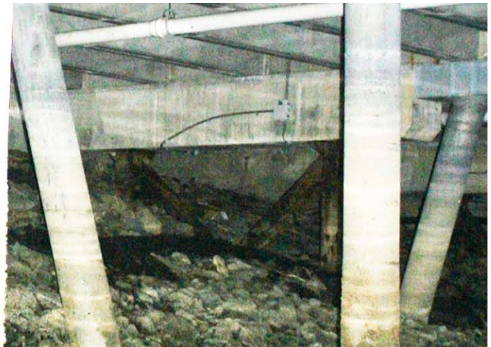
E.5 and E Lines from Northwest

Conditions may have changed. Contractor responsible to verify current conditions