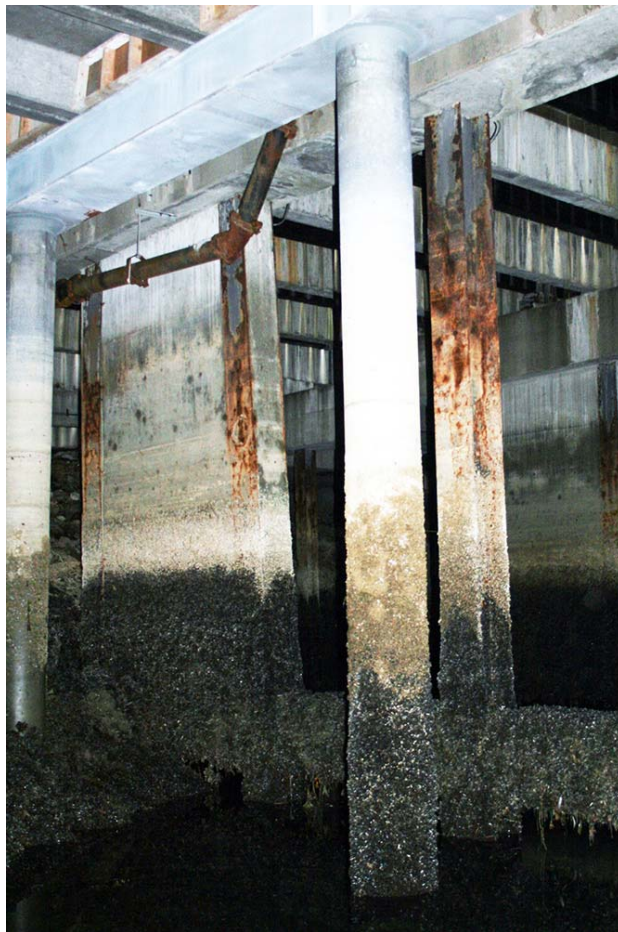
D Line from Northwest, Piles 5 - 7

Conditions may have changed. Contractor responsible to verify current conditions