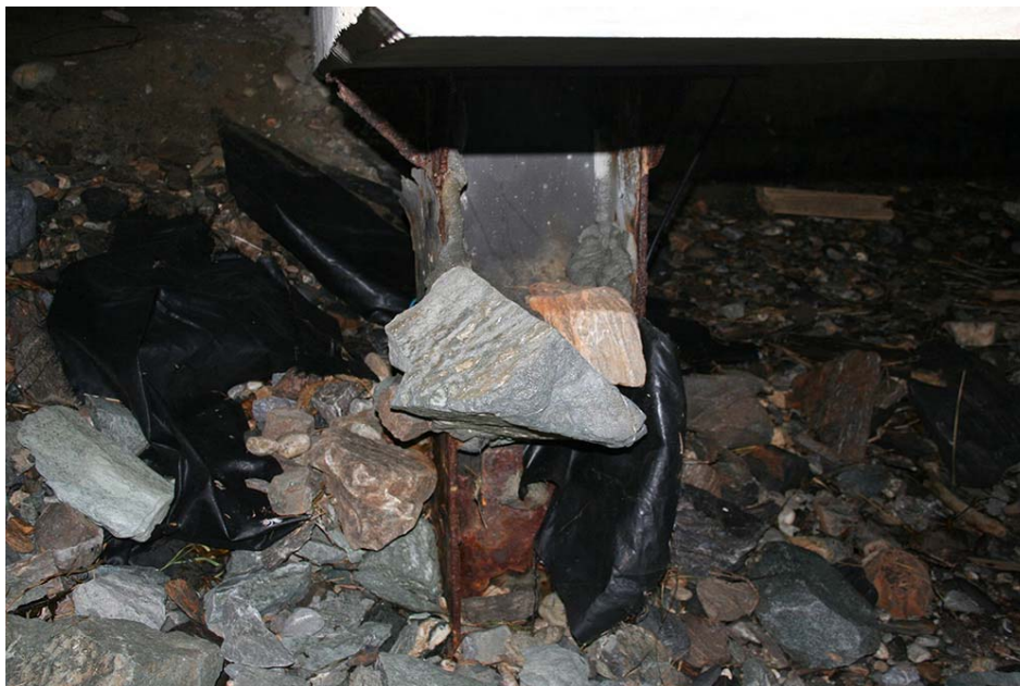
F.5 Pile from West (Note Rocks Trapped in Web in Concrete Bleed from Casting Beam)

Conditions may have changed. Contractor responsible to verify current conditions