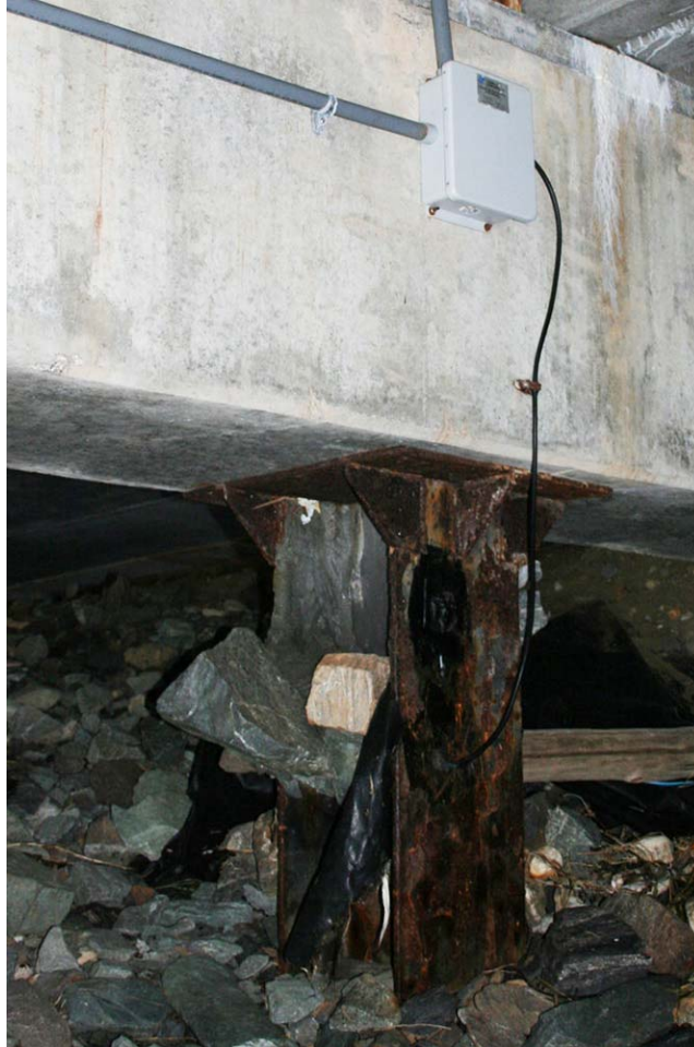
F.5 Pile from Southwest (Note Rocks Trapped in Web from Concrete Bleed when Casting Beam)