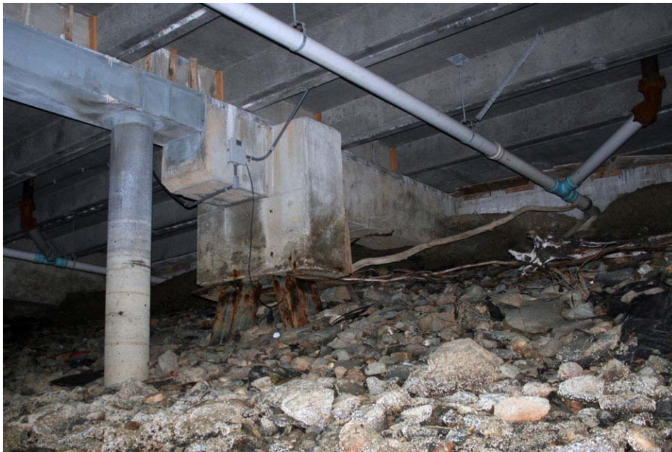
F Line from Southwest

Conditions may have changed. Contractor responsible to verify current conditions