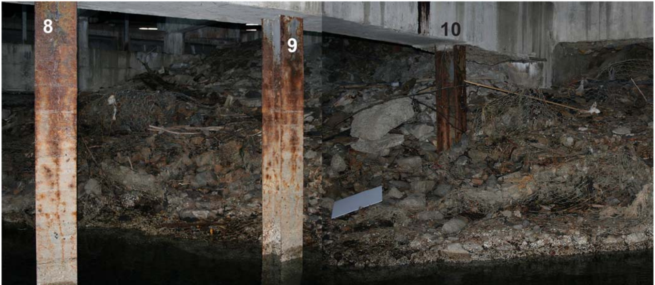
C.5 Line from Southwest, Piles 8 - 10

Conditions may have changed. Contractor responsible to verify current conditions