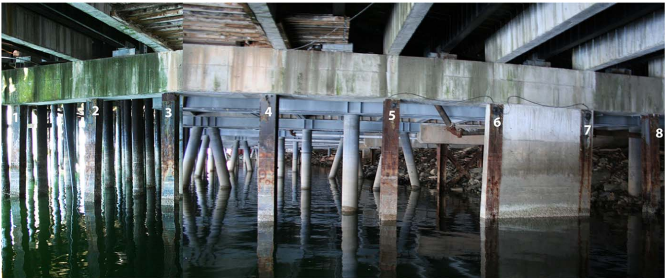
D Line Composite from South (D.5 in Background)

Conditions may have changed. Contractor responsible to verify current conditions