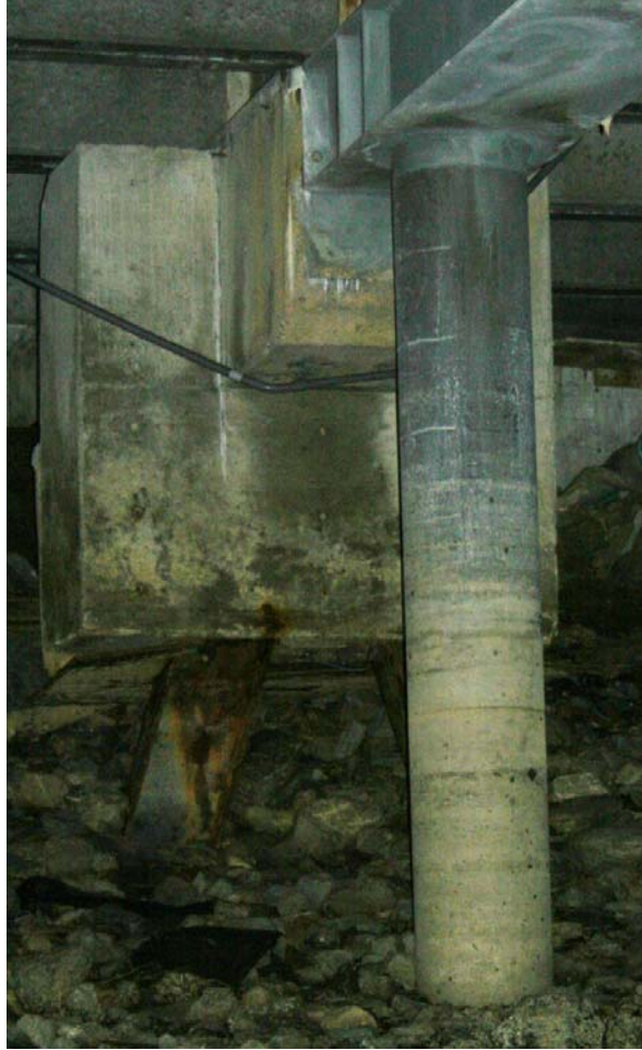
F Line from Northwest