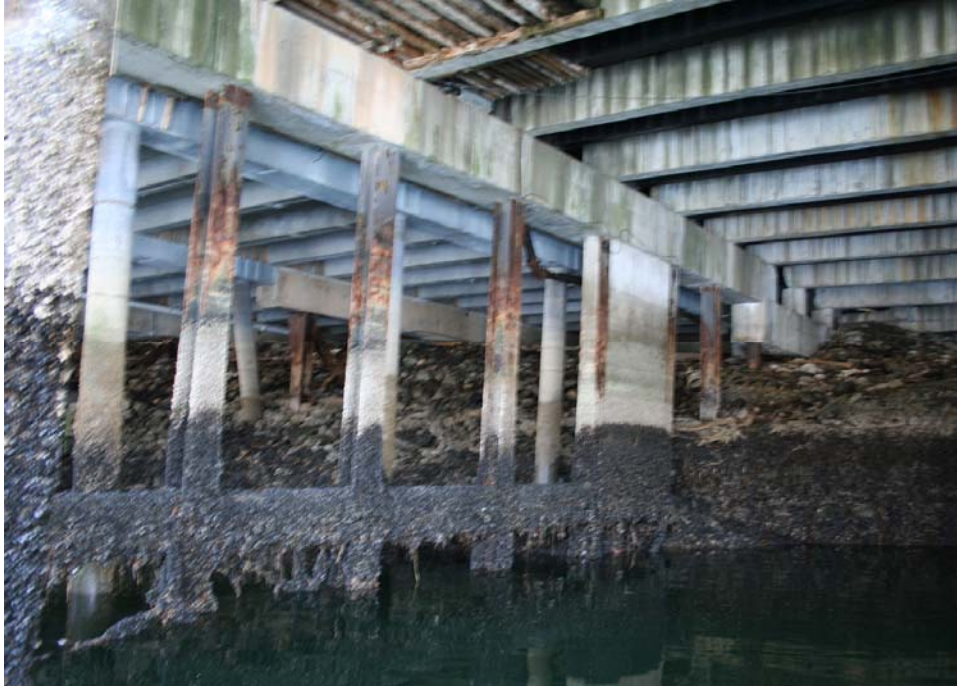
D Line at Low Tide, from Southwest (D.5 in Background)