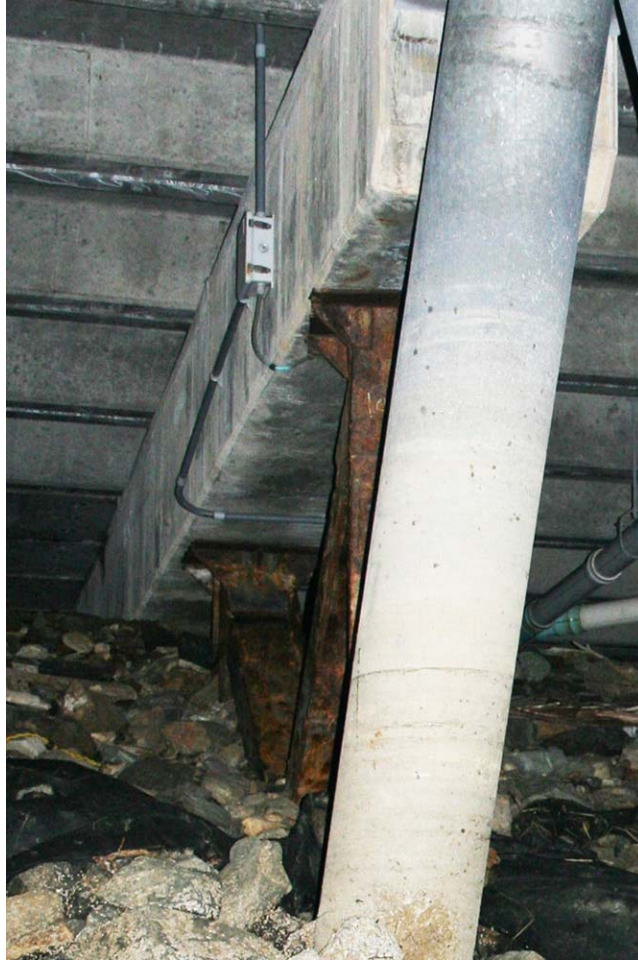
E Line from Northwest