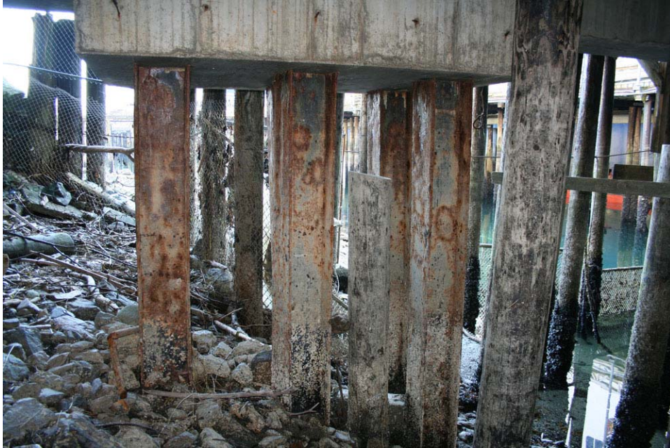
Cap A6 from North