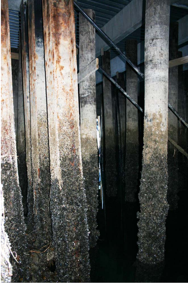
Cap B7 from North