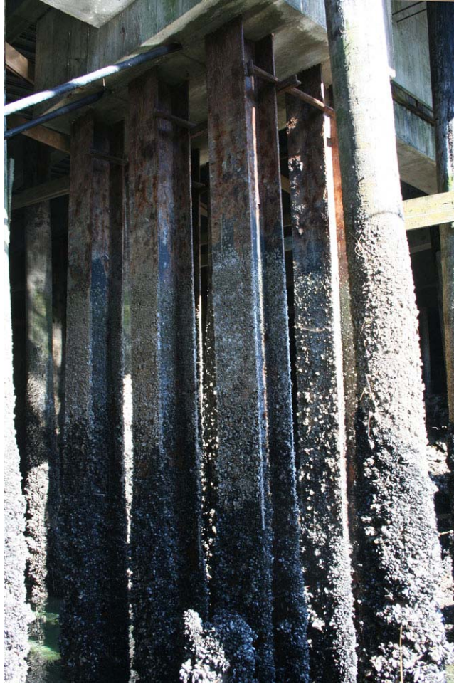
Cap A7 from Southwest

Conditions may have changed. Contractor responsible to verify current conditions