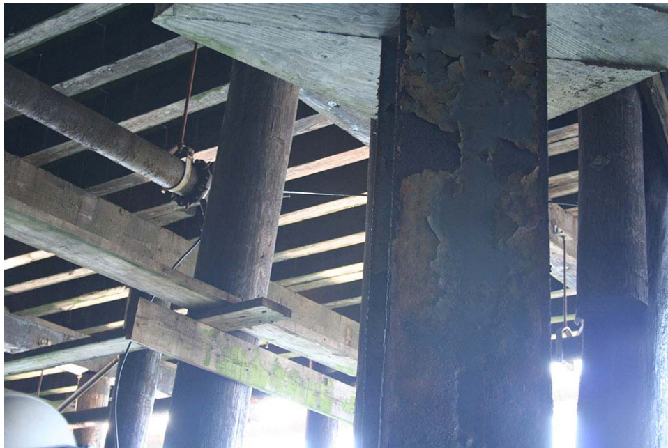
Cap C10 from Northeast

Conditions may have changed. Contractor responsible to verify current conditions