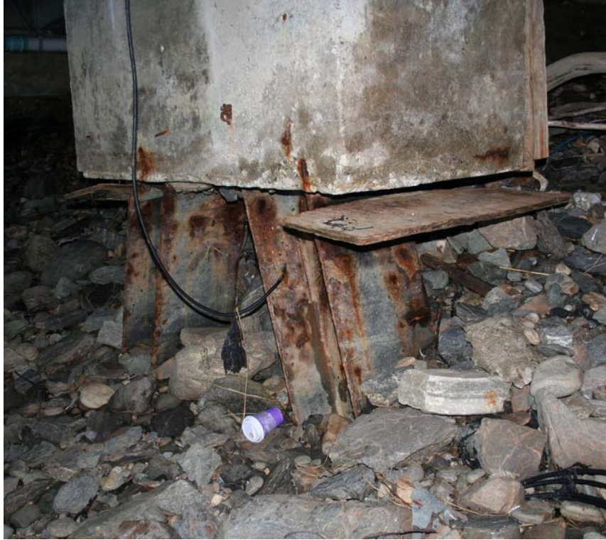
F Line from Southwest – Close Up