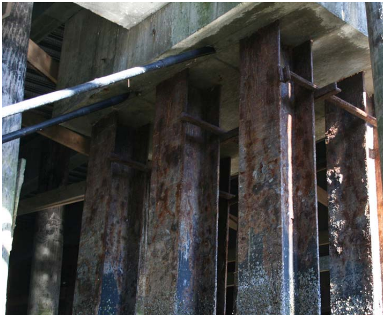
Cap A7 from Southwest

Conditions may have changed. Contractor responsible to verify current conditions