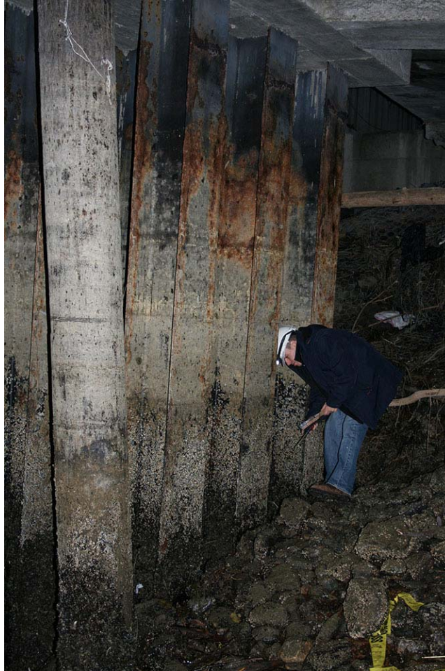
C7 Cap from Southeast