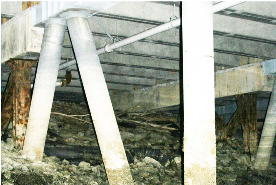
E and D.5 Lines from Northwest

Conditions may have changed. Contractor responsible to verify current conditions