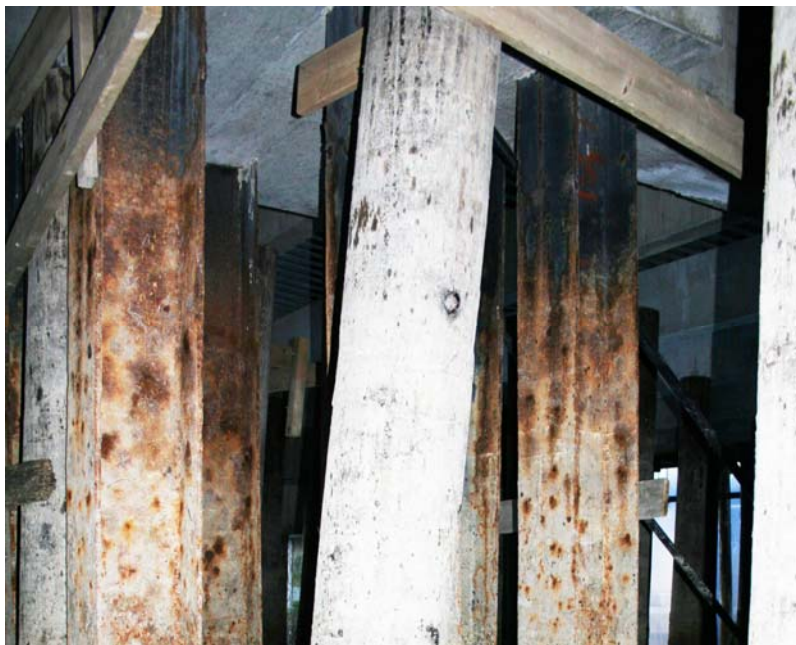
Cap B7 from Northeast

Conditions may have changed. Contractor responsible to verify current conditions