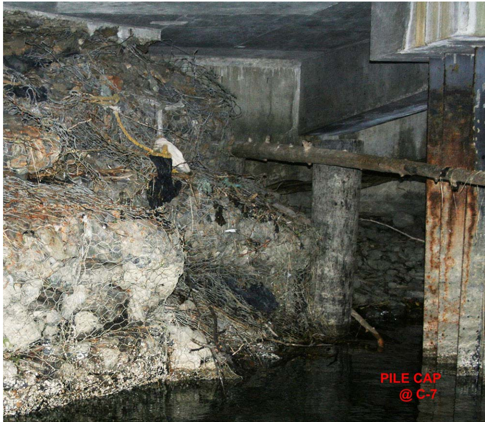
Cap C7 from Northwest