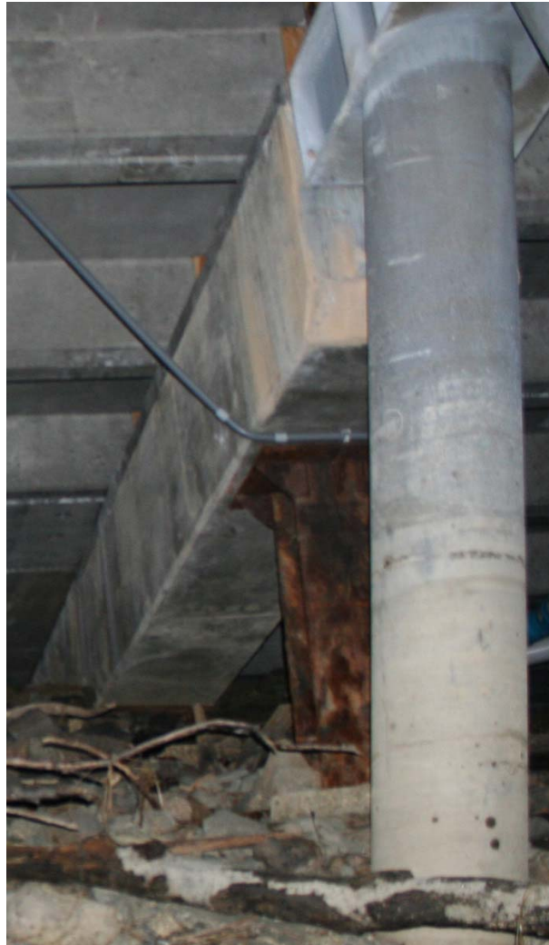
E.5 Line from Northwest

Conditions may have changed. Contractor responsible to verify current conditions