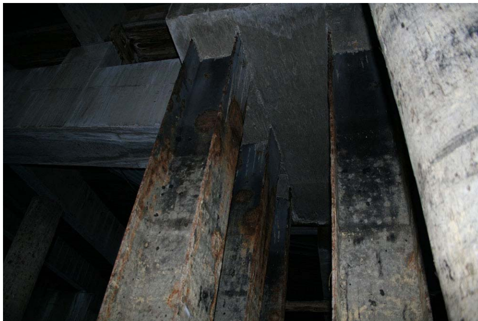
C7 Cap from South

Conditions may have changed. Contractor responsible to verify current conditions