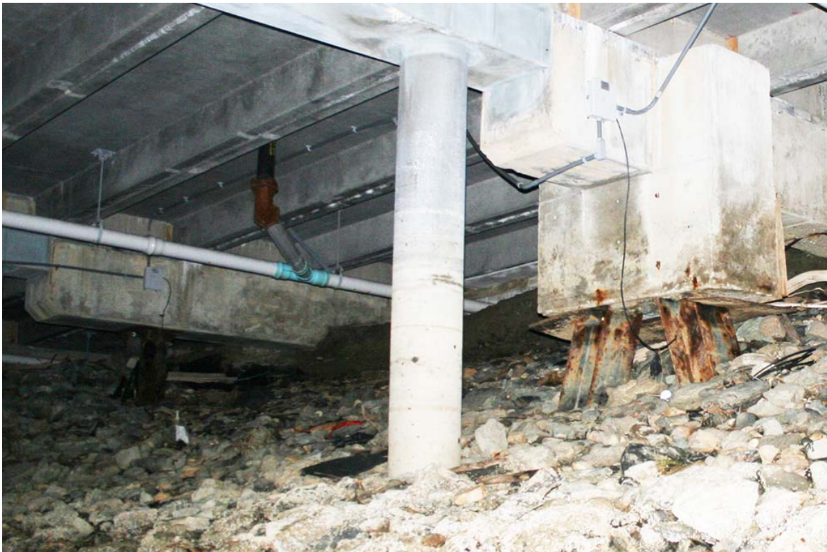
F.5 and F Lines from Southwest

Conditions may have changed. Contractor responsible to verify current conditions