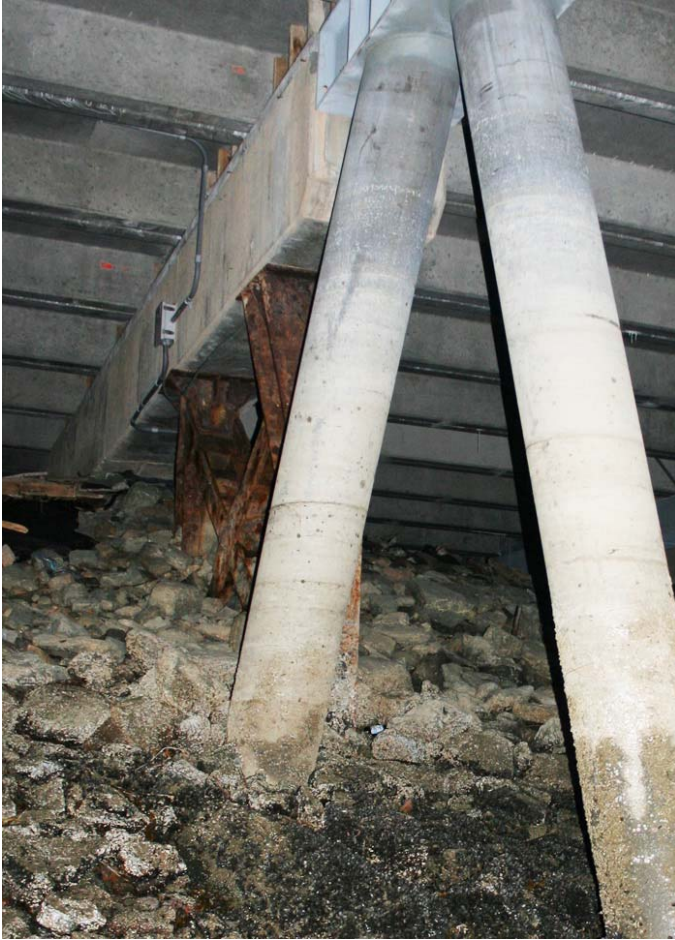
D.5 Line from Northwest