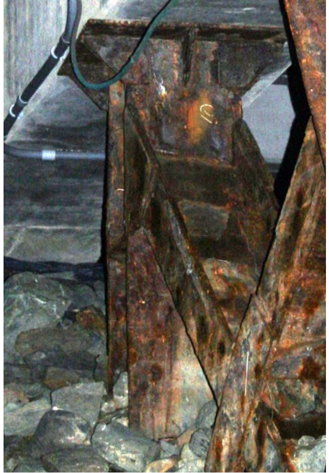
D.5 Line from Northwest – Close Up