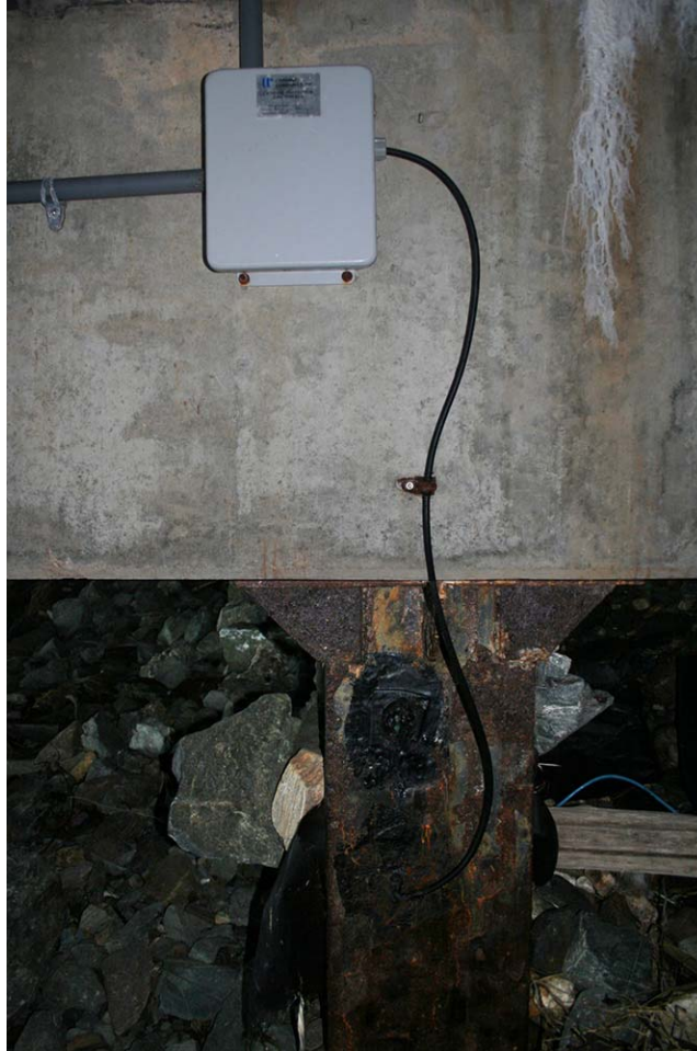
F.5 Line & J-Box from South (Note Rocks Trapped in Mortar in Left Web)