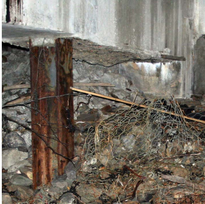
C.5 Pile 10 from Southwest