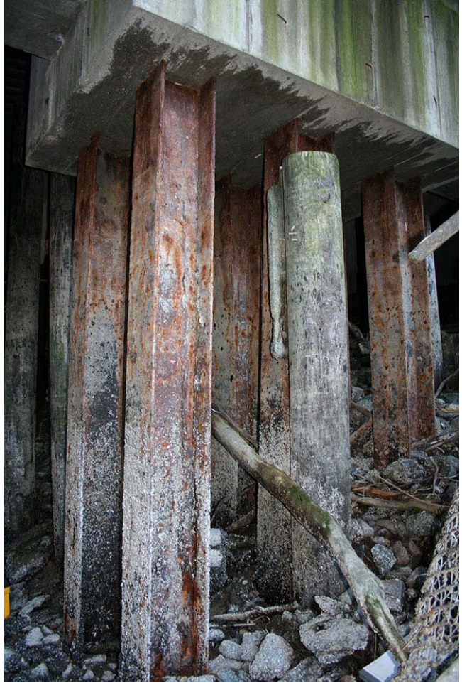
Cap A6 from Southwest