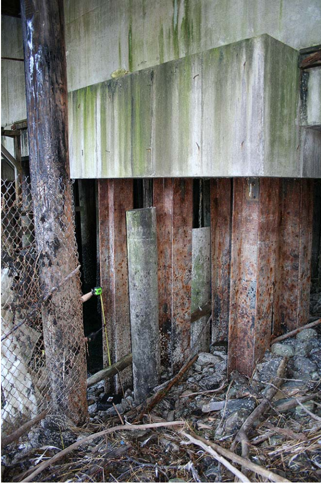
Cap A6 from Southeast