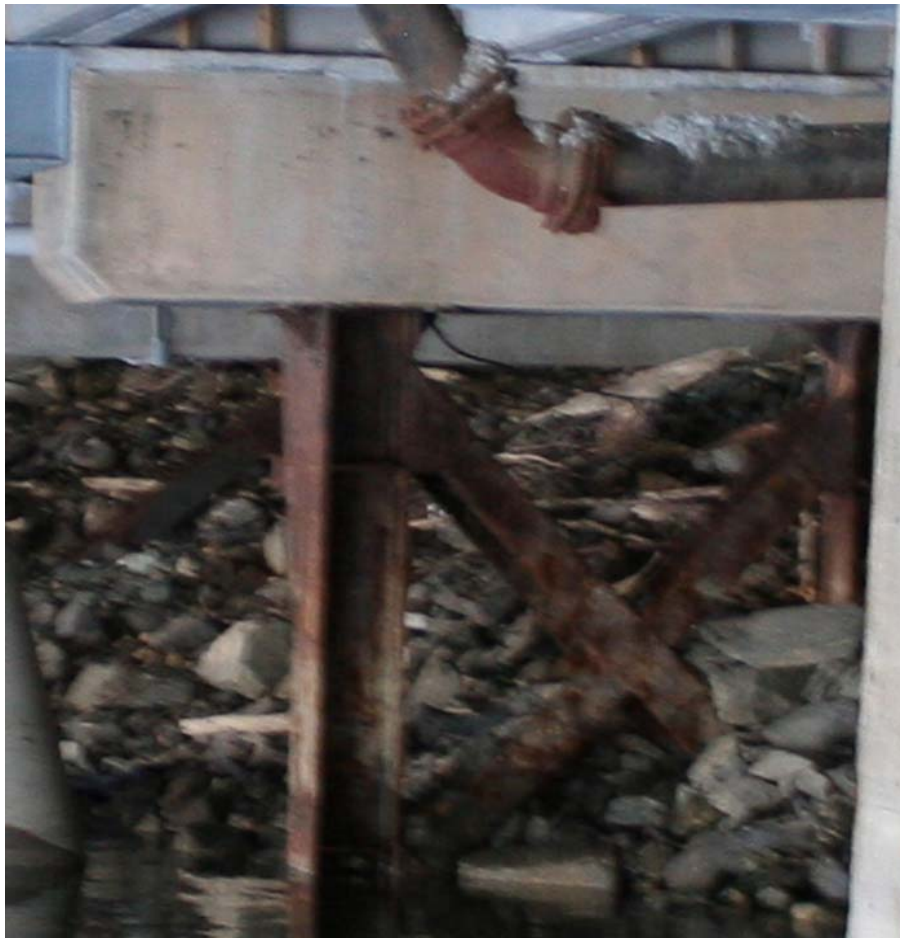
D.5 Line from South

Conditions may have changed. Contractor responsible to verify current conditions