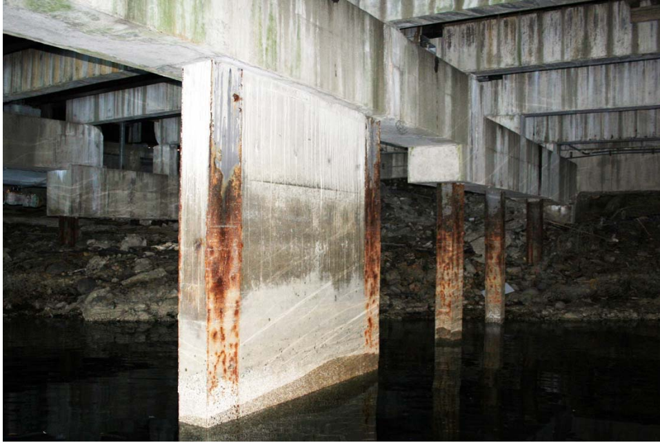
C.5 Line from Southwest, Shear Wall – Piles 6 - 10