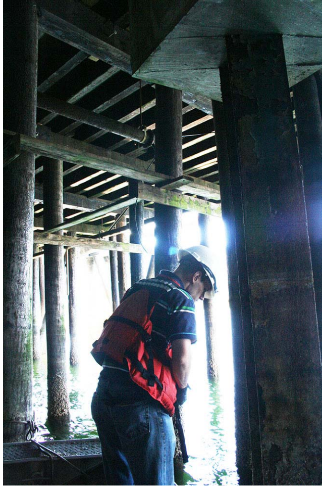
C10 from Northeast