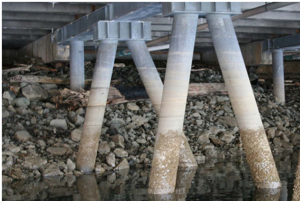
G and F.5 Lines from Northwest

Conditions may have changed. Contractor responsible to verify current conditions