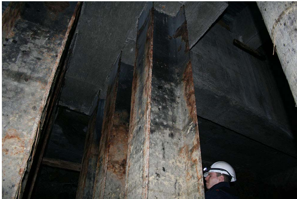
C7 Cap from Northeast

Conditions may have changed. Contractor responsible to verify current conditions