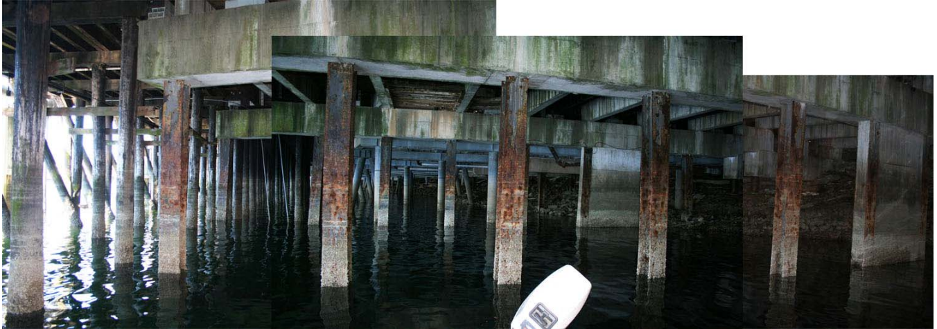
C.5 Line Composite from South (D Line in Background)