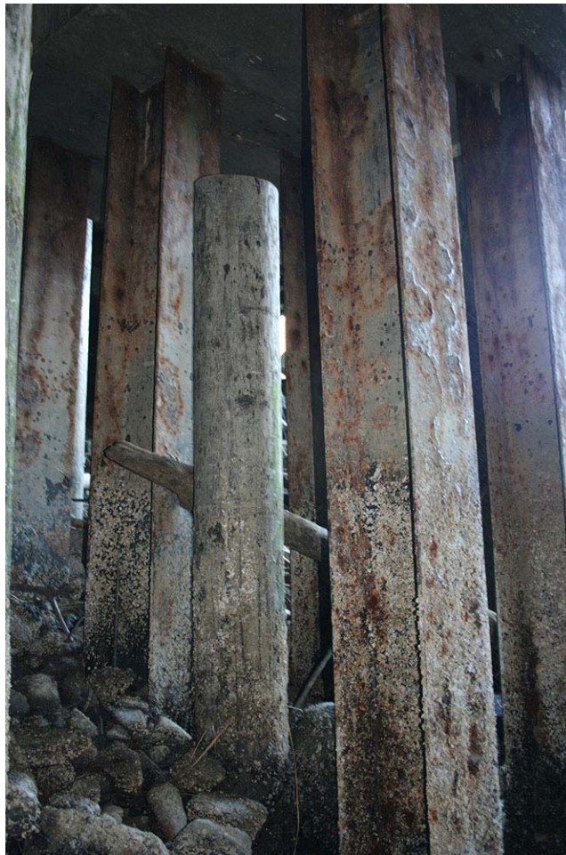
Cap A6 from Northwest

Conditions may have changed. Contractor responsible to verify current conditions