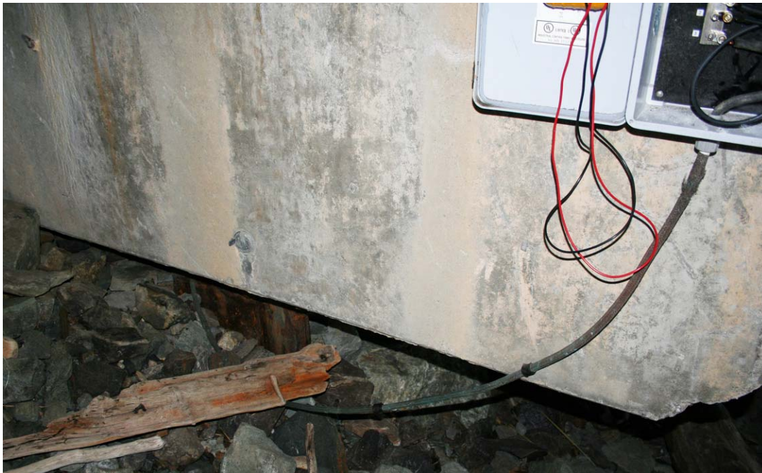
G Line from North – Close Up

Conditions may have changed. Contractor responsible to verify current conditions