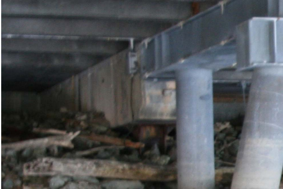
G Line from Northwest