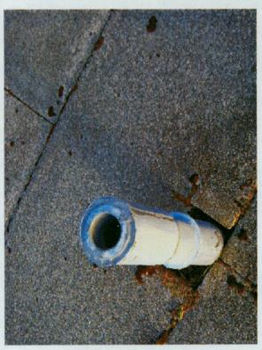
C-2 3" PLUMBING VENT