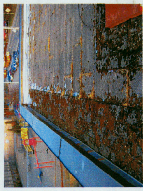
A-2 OVERALL VIEW