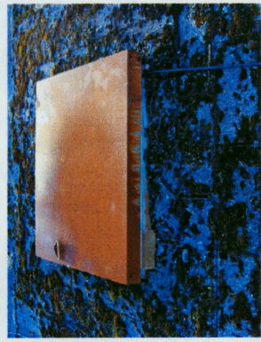
F-2 HATCH COVER