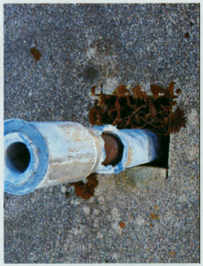
D-2 1 1/2" PLUMBING VENT