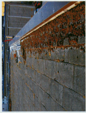
B-2 OVERALL VIEW