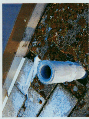
E-2 4" PLUMBING VENT

Do not scale from this drawing, use dimensions