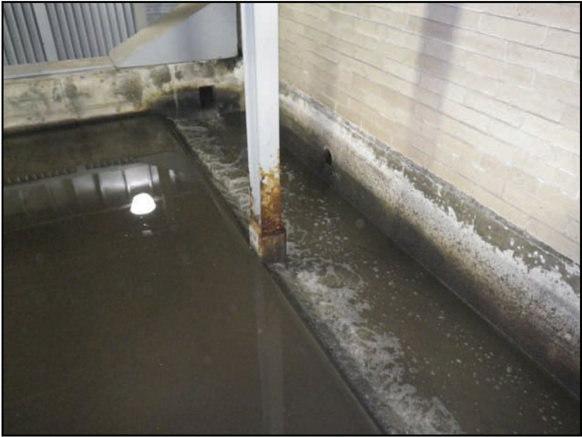
3. Juneau WWTP headworks trough