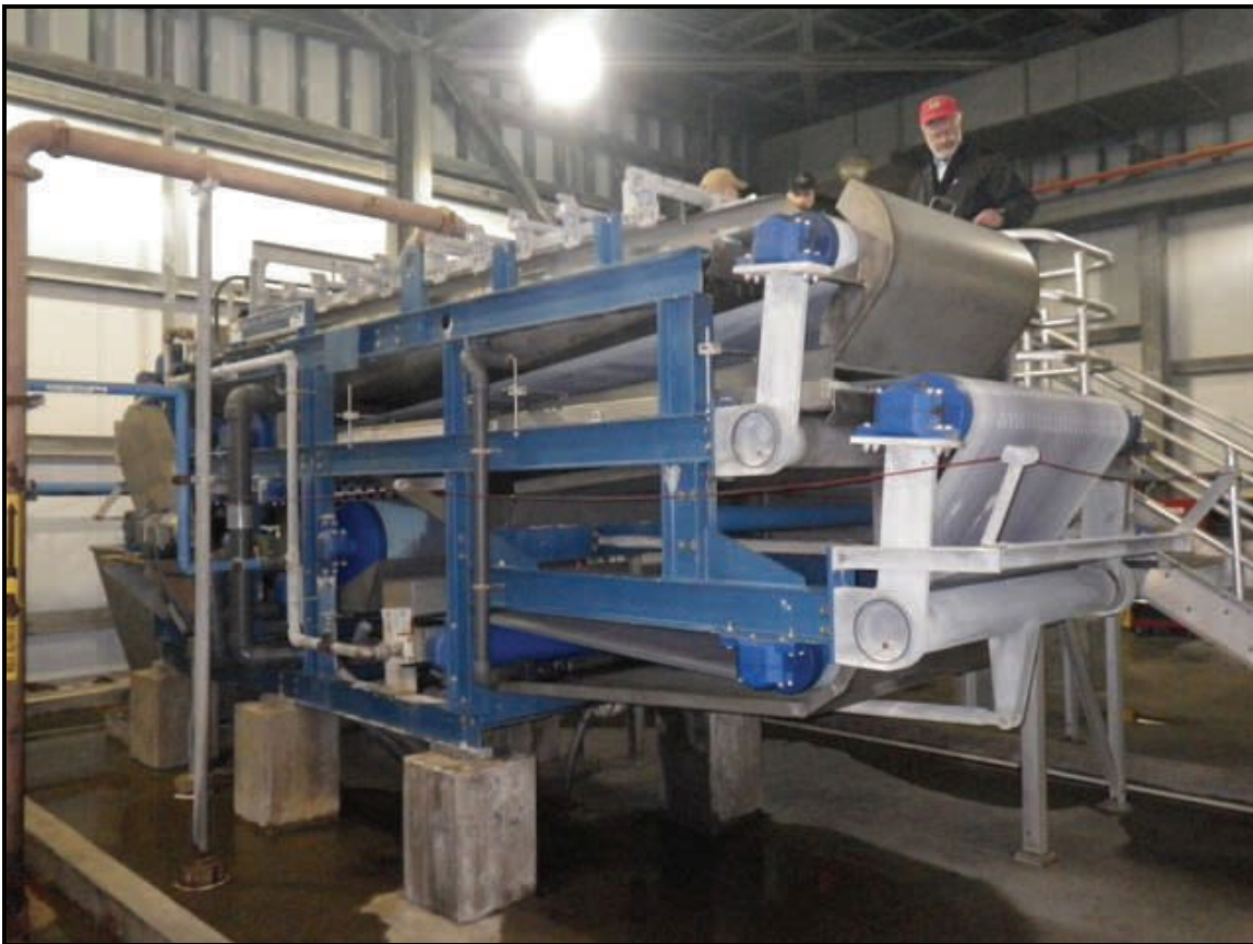
13. Juneau WWTP belt filter press