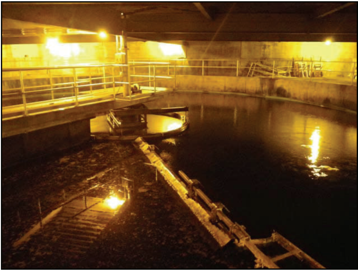
8. Juneau WWTP secondary clarifier