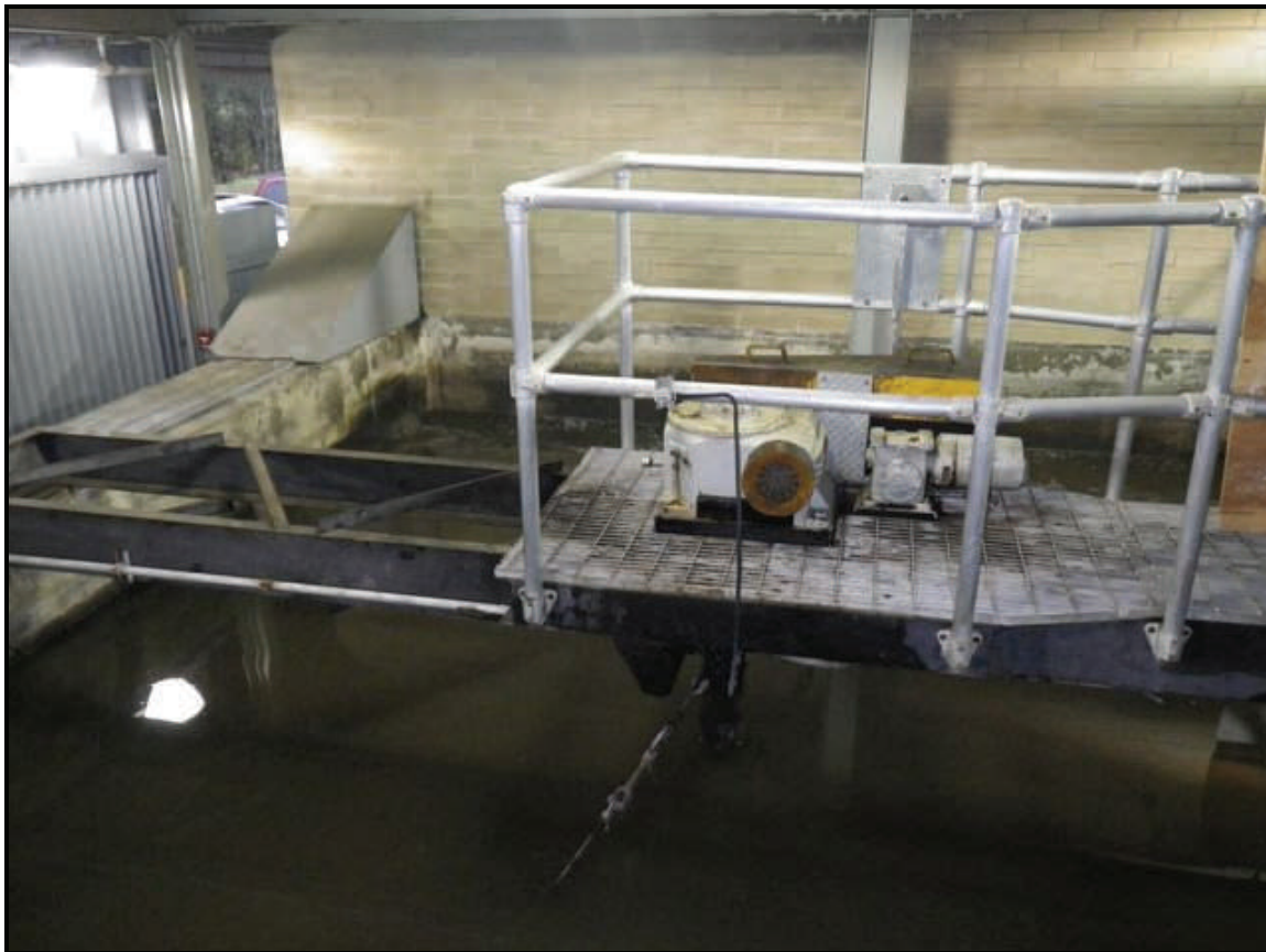
2. Juneau WWTP headworks top view