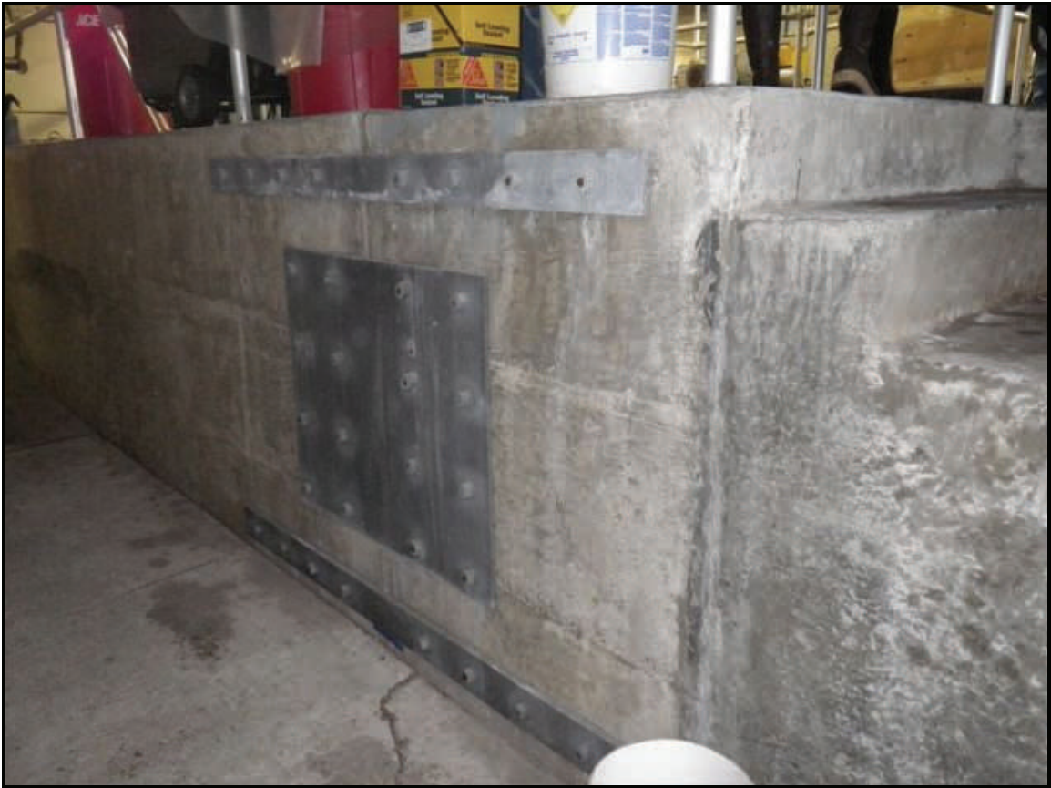
1. Juneau WWTP headworks