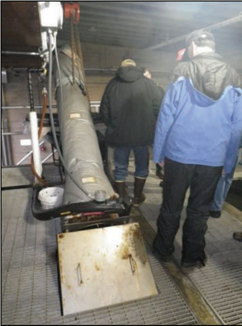
5. Juneau WWTP headworks