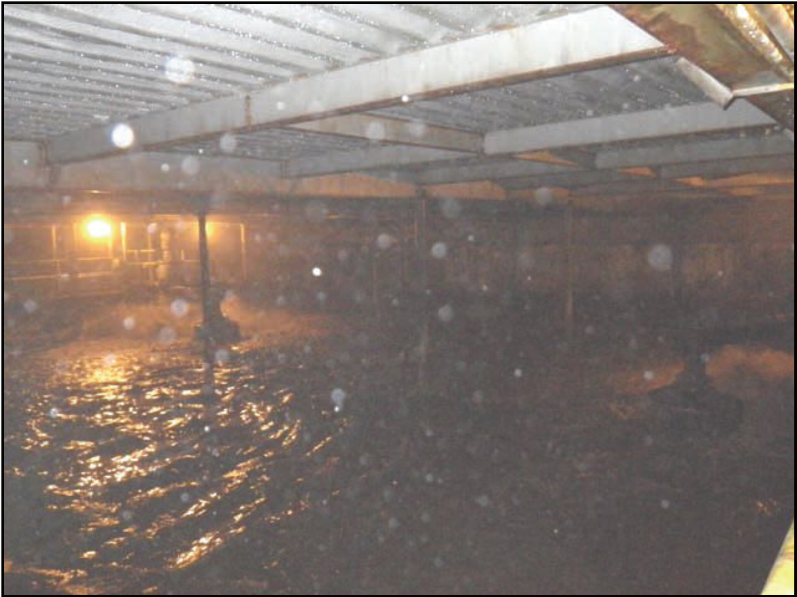
6. Juneau WWTP aeration basin