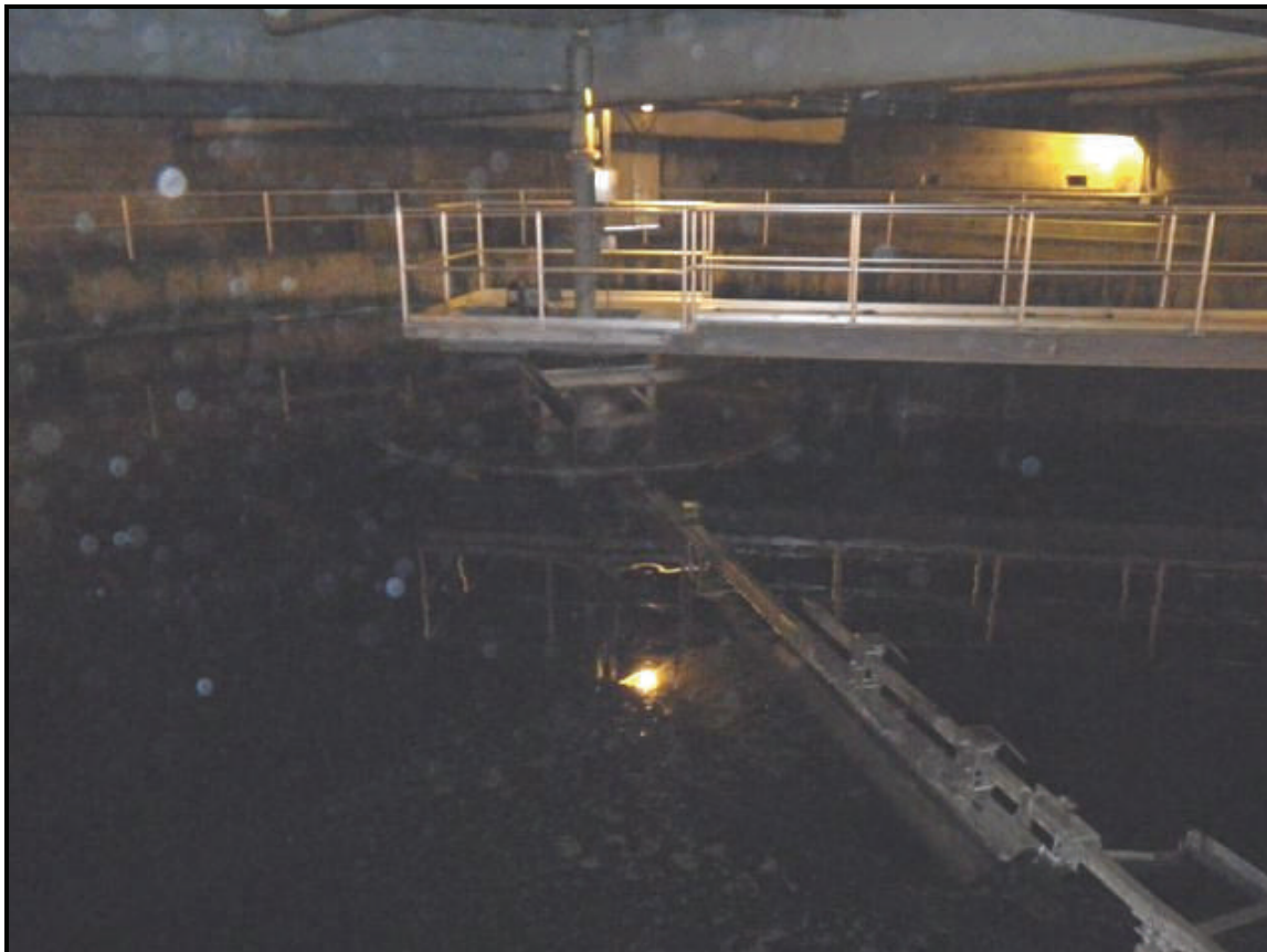
7. Juneau WWTP secondary clarifier