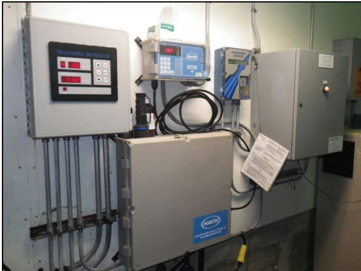
11. Juneau WWTP effluent monitoring