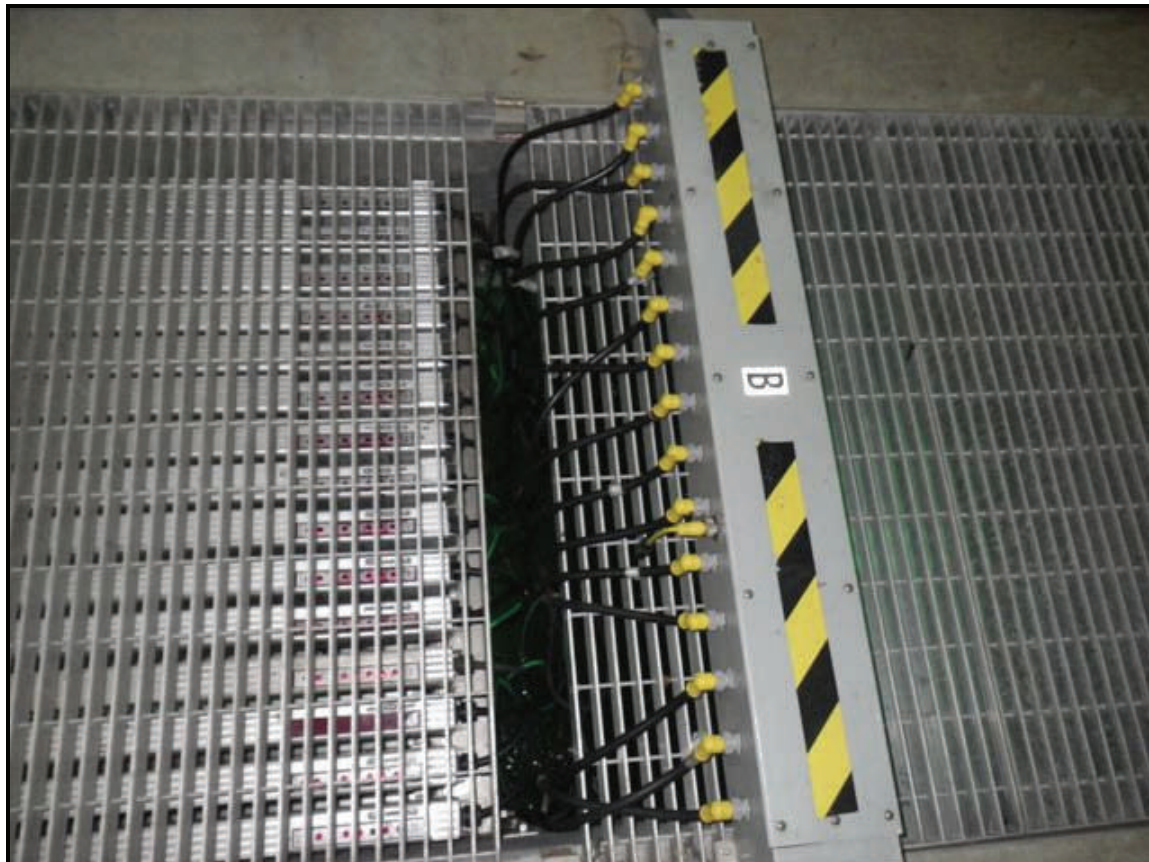
9. Juneau WWTP UV disinfection