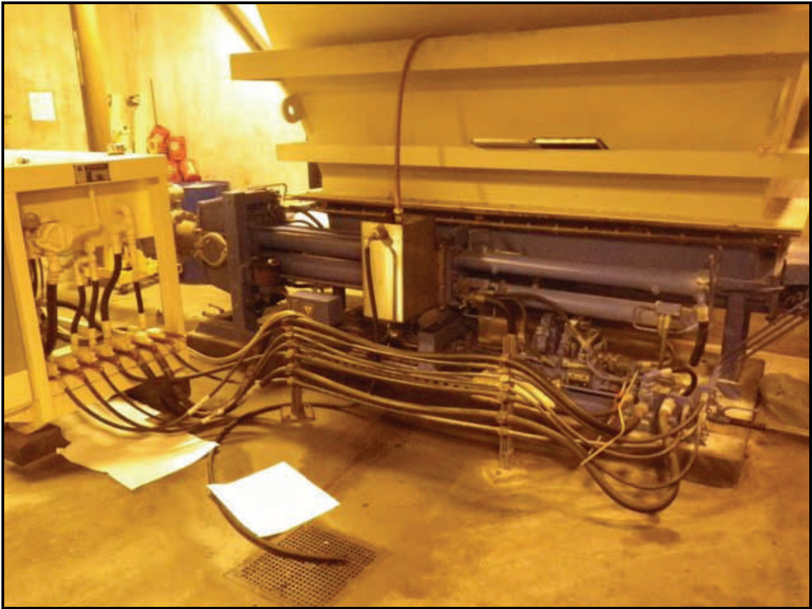
12. Juneau WWTP solids polymer system