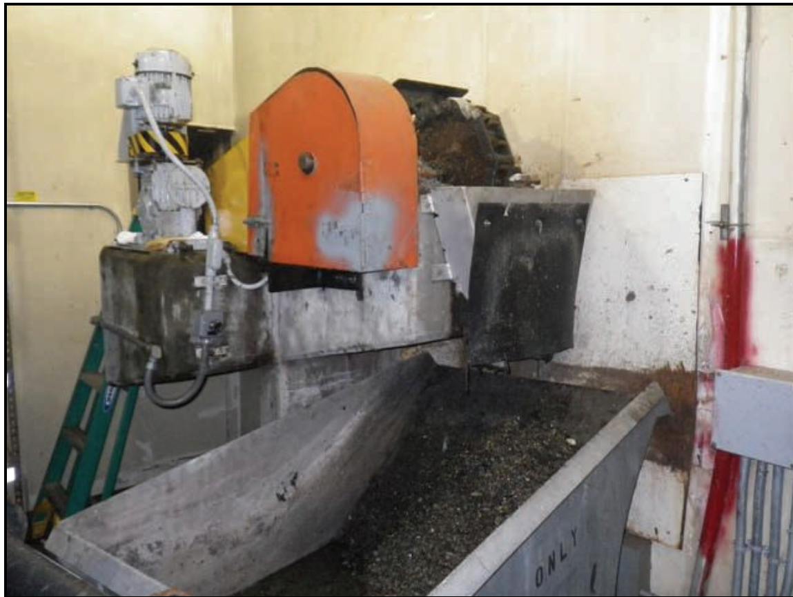
4. Juneau WWTP grit bin