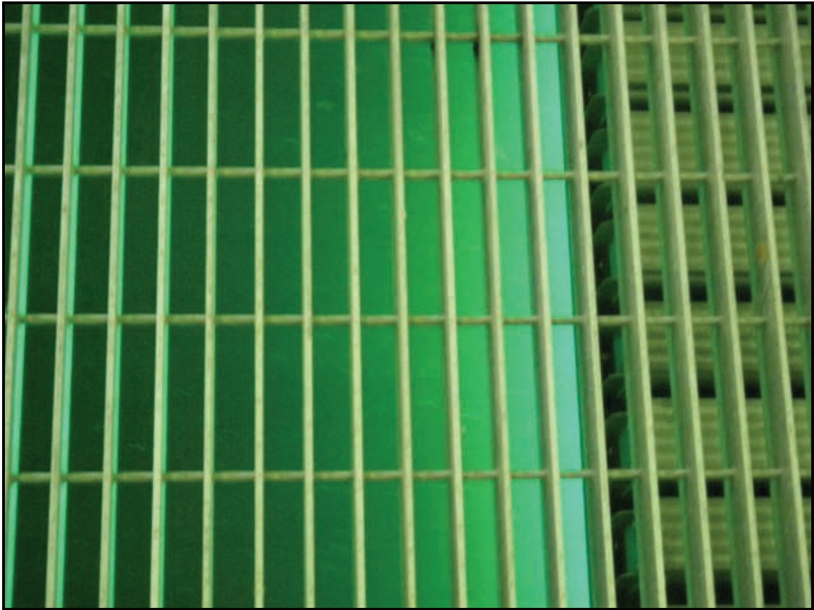
10. Juneau WWTP UV disinfection