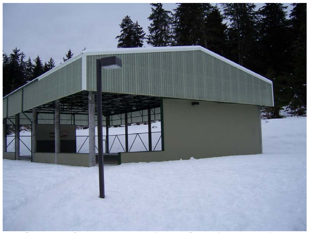
East Side of the Covered Play Area (Facing School/ Parking Lot)