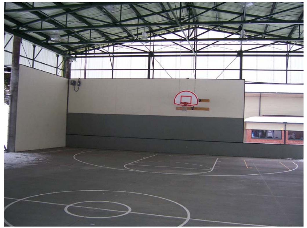
Inside Covered Play Area Facing School.