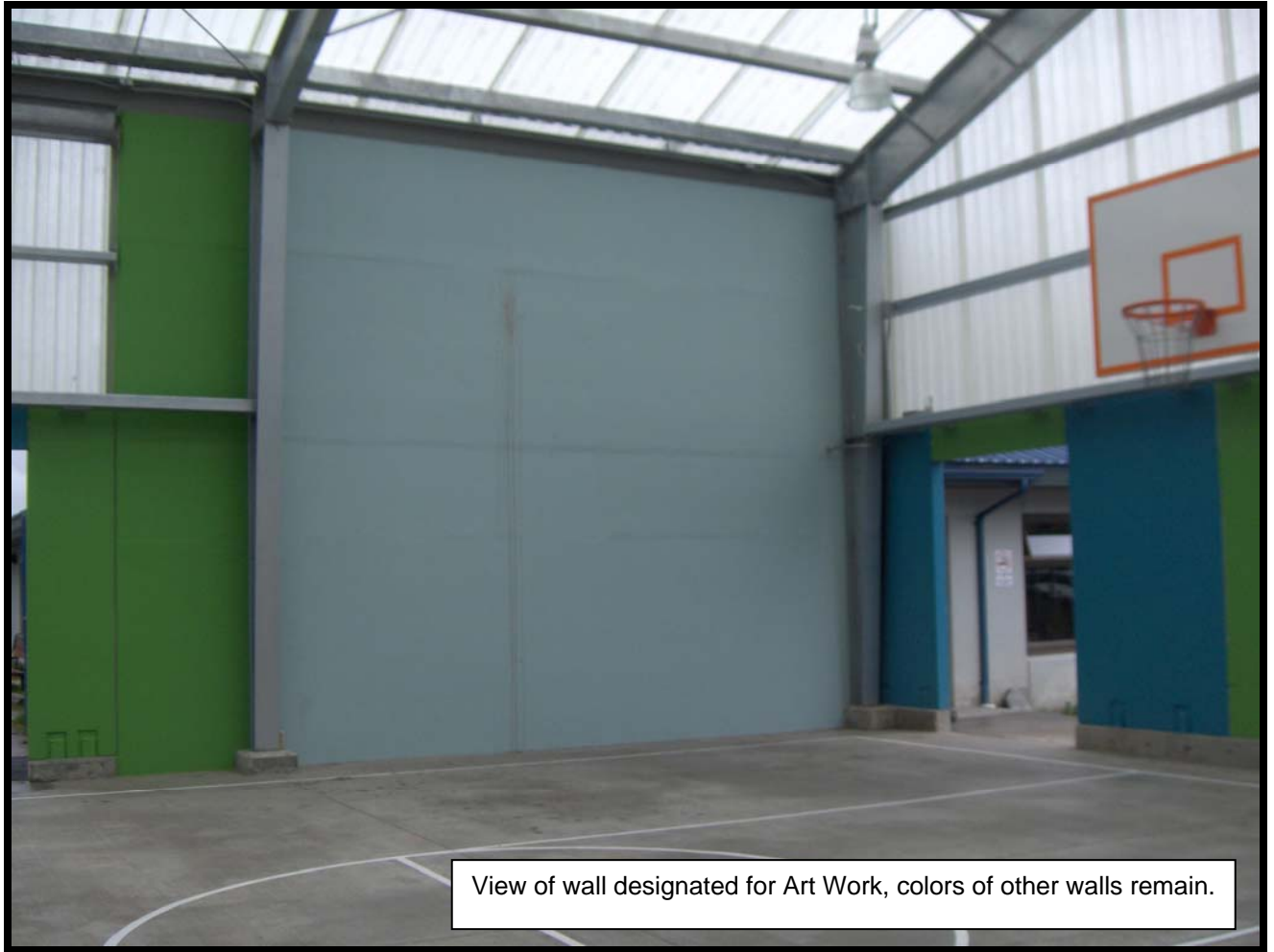
View of wall designated for Art Work, colors of other walls remain.