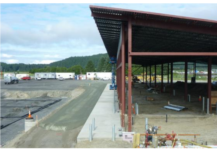
SREB partial east elevation with geothermal loop field to south.