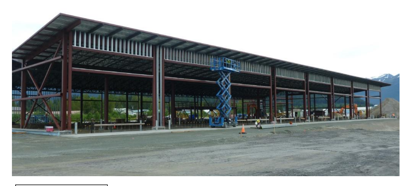
SREB south elevation.