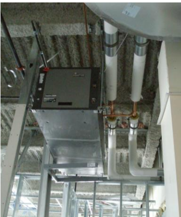
Heat pump #35 set in place.

The Concessions Expansion project is proceeding well. Framing is complete, and electrical and mechanical rough-ins are 80% complete. Plumbing pressure tests are underway today to allow for code inspection and authorization to cover walls. A few change order items have emerged due to existing conditions that were not known during design, and due to changes requested by the concessionaire to support operations. The new commercial equipment for the Prep Kitchen and Bar will arrive at the airport on June 8, 2015. This order includes owner-furnished equipment such as the 3-compartment sink and the bar equipment, which will be installed and trimmed out by the contractor. Purchasing the equipment under a separate contract assured that the construction schedule could be met. At this time, it appears that the project will come in close to the expected budget, and be completed within the contract time. Operations in all areas are expected by July 3rd.