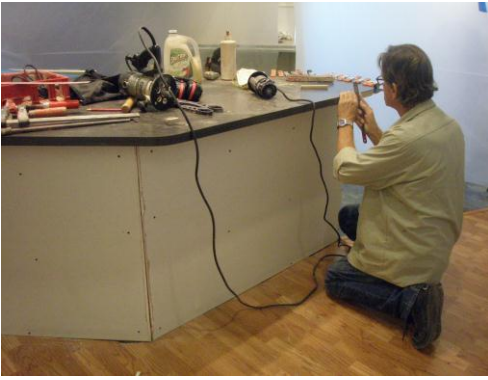
The Counterfitters modify the counter top in the new concession space.