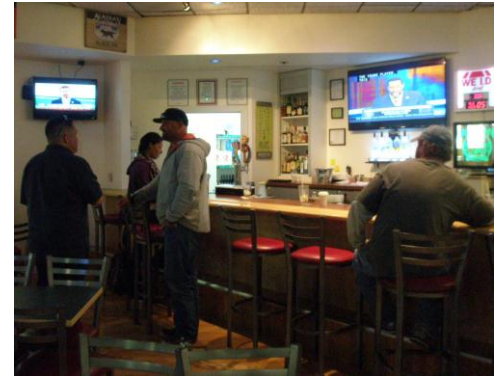
Travelers enjoy Romeo's Tap Room.