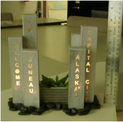
Model of 2011 Gateway/Welcome Sign, approx. scale 1" = 2'