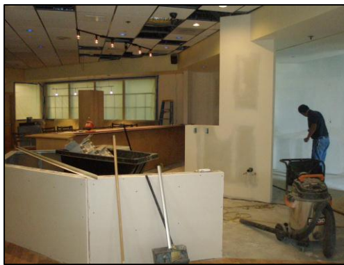
Construction progress in Romeo's Taproom .