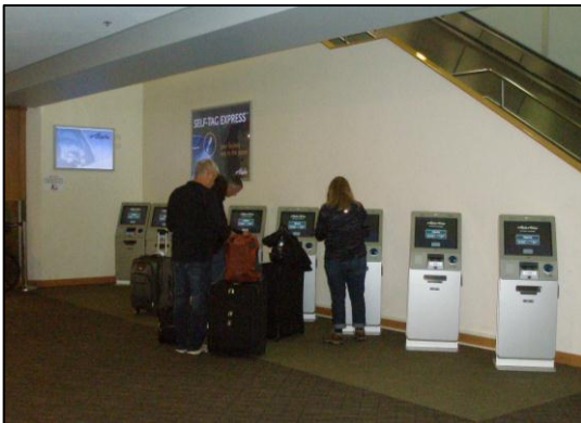
Alaska Airlines' check in kiosks.

The terminal project work session was held on 26, 2014, with 24 people in attendance. The history of the terminal renovation since 2005 was reviewed, concepts for addressing the renovation needs that still exist were discussed, and possible financing options were identified. A summary of the meeting is included in the July 9 JNU Airport Board meeting packet.