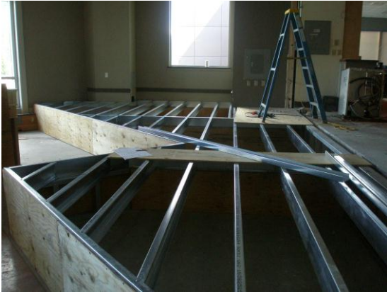
New raised floor for DJ's Tap Room (former bar).