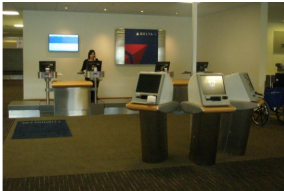
Delta Air Lines check in area.