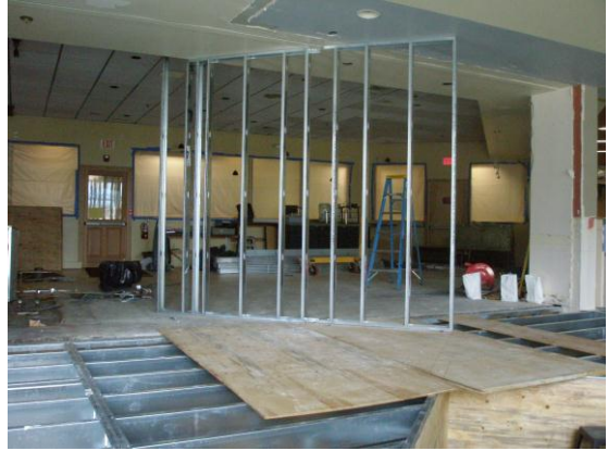
New wall framing for DJ's Tap Room.