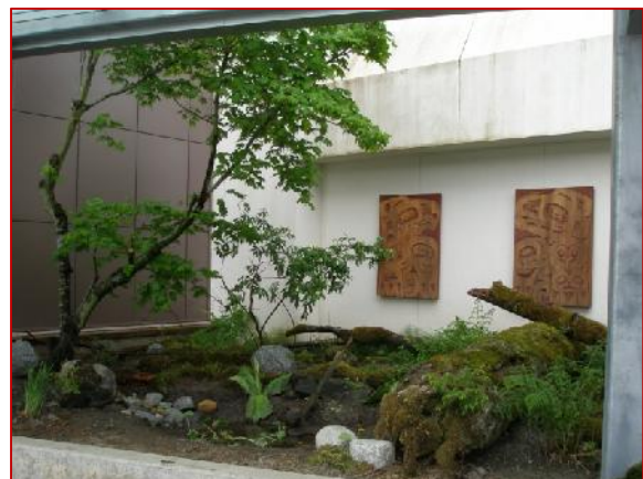
Eagle Scout Landscape Project.