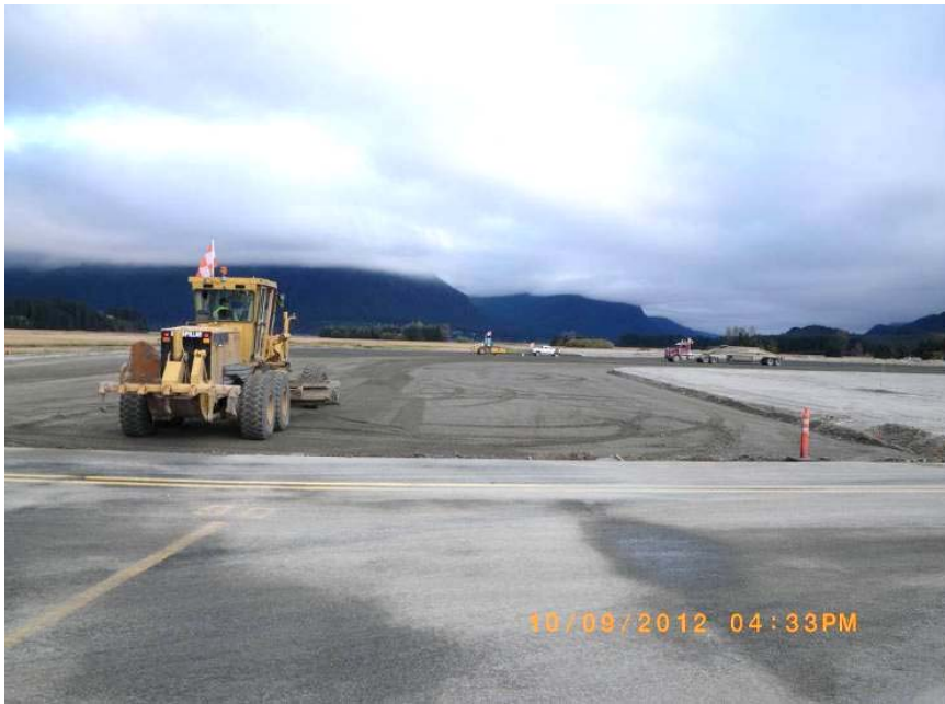
This image, taken on October 9, shows D-1 being placed for runway 26 extension.