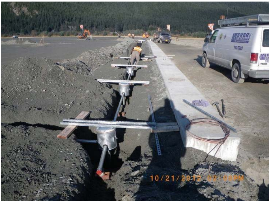
This image, taken on October 21, shows Ever Electric installing threshold lights. Also visible is the newly completed threshold bar that was installed by FAA's contractor