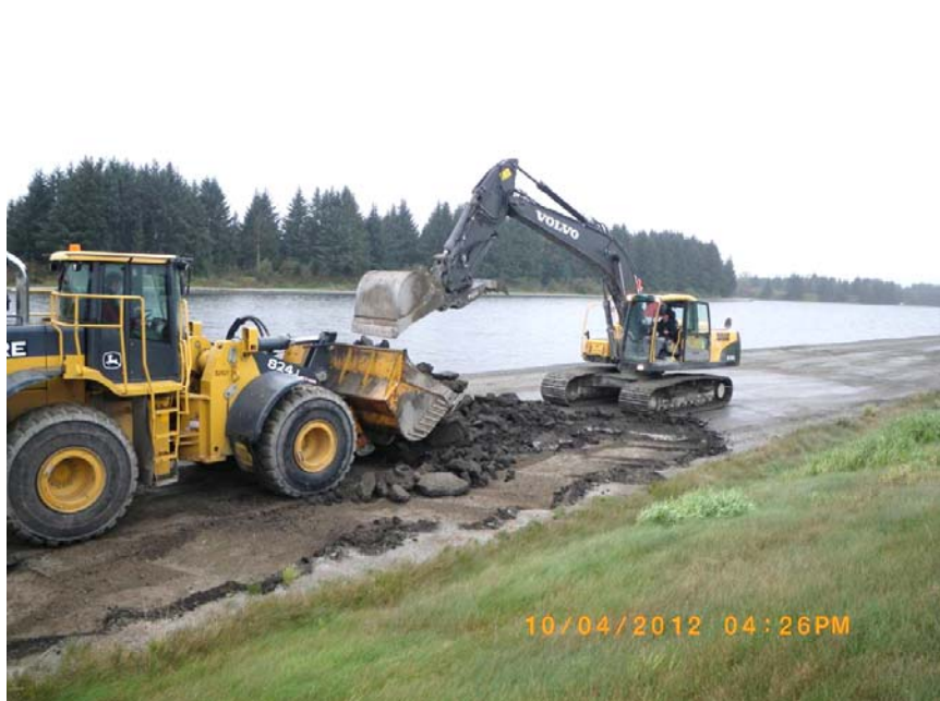
This image, taken on October 4, shows asphalt removal underway on north float plane pond road.