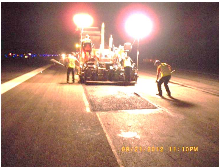
This image, taken on September 21, shows the night time operation to repair logitudinal joints on the runway.