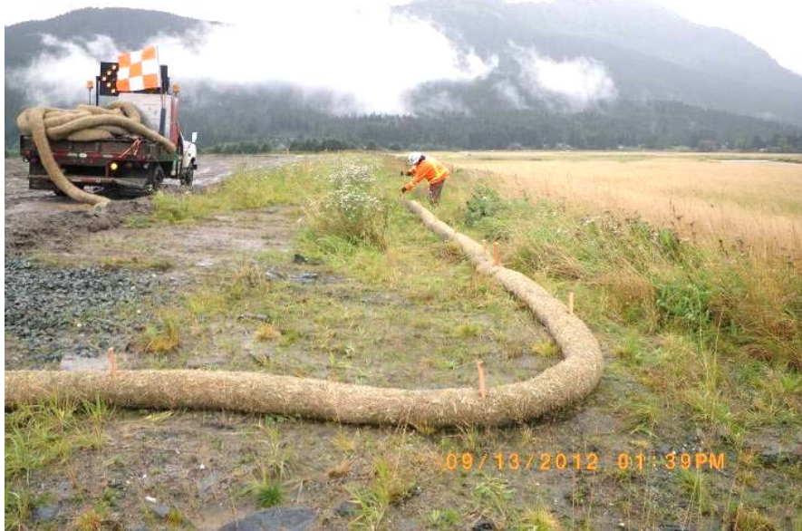
This image, taken on September 13, shows SWPPP measures being installed at the east end of the RSA.