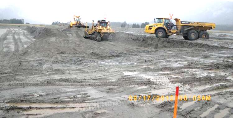
This image, taken on September 17, shows Channel Construction excavating material in preparation for the structural section for the extended runway and taxiway.