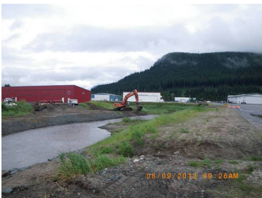
This image, taken on August 9, shows bank restoration efforts at Jordan Creek, just north of Taxiway A.