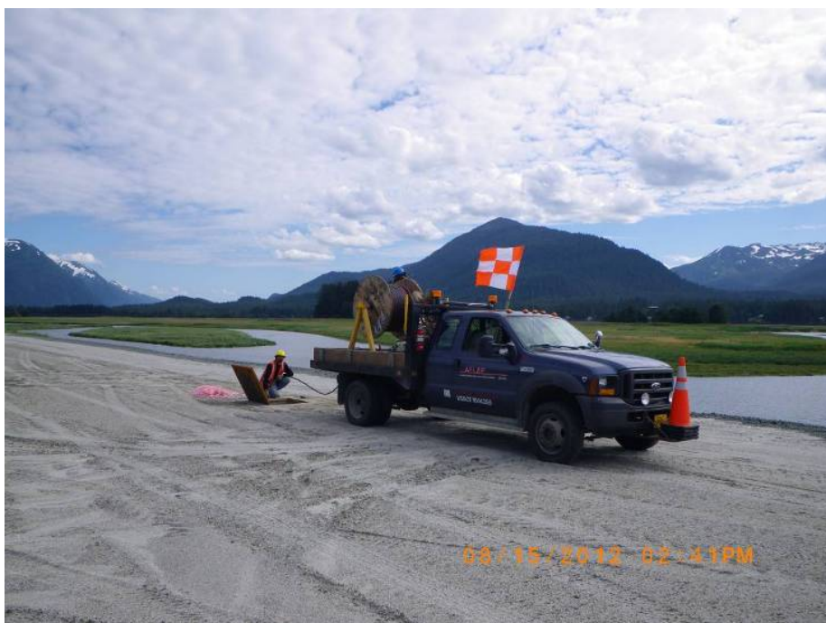
This image, taken on August 15, shows AEL&P pulling conductors for high voltage primary power that will go the east end of the runway.