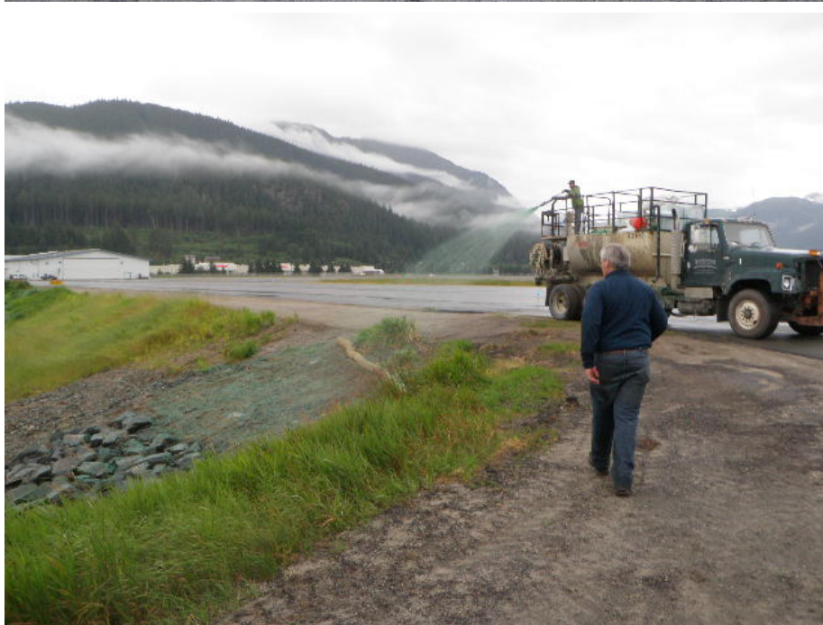
This image, taken on August 25, shows final hydroseeding along the bank of Jordan Creek.