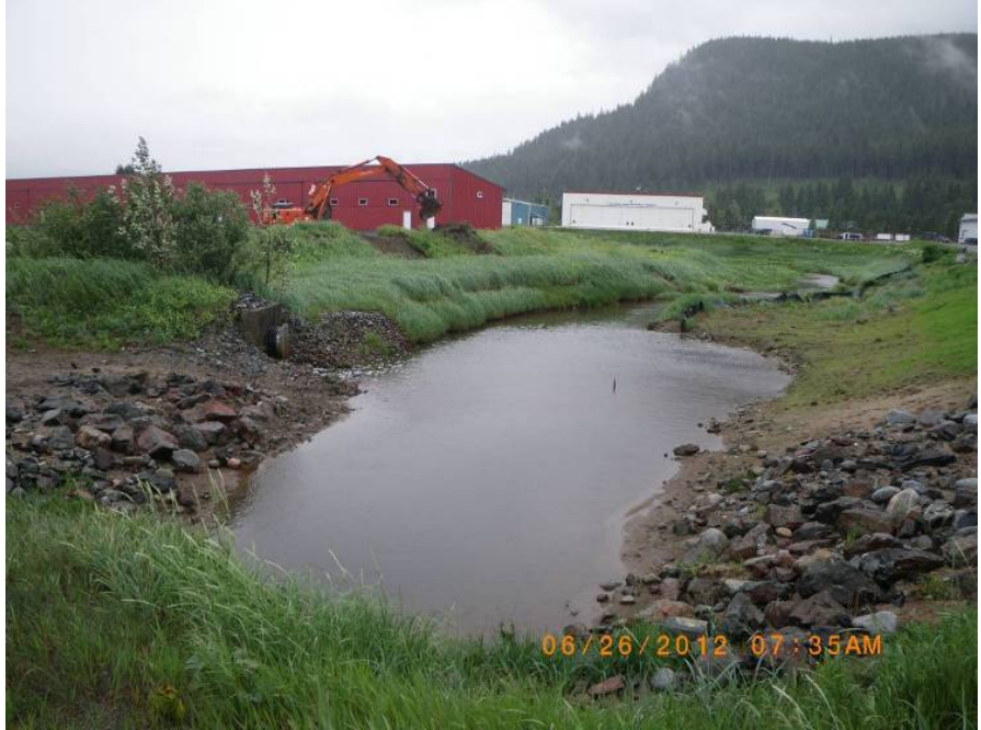
This image, taken on June 26, shows initial preparation work for the Jordan Creek culvert repair effort. June 25 was the first day AIC could be in the water and they are obligated to finish the work by August 20.