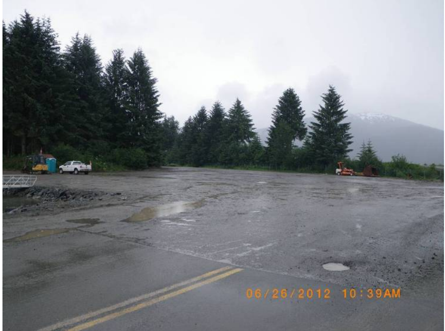
This image, taken on June 26, shows final status of the AIC shop area after they had successfully demobilized from the area.