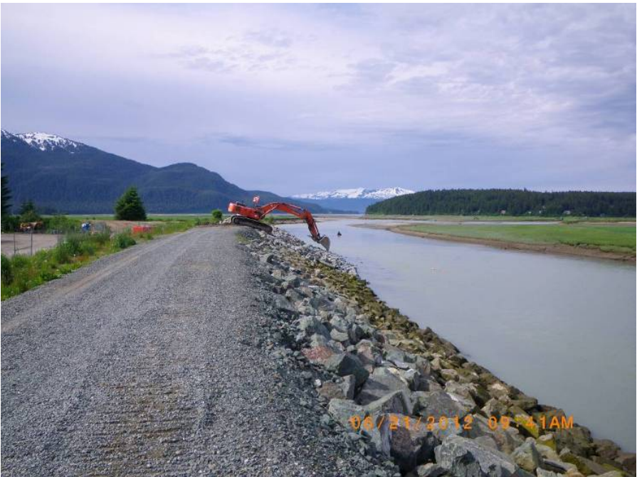
This image, taken on June 21, shows the final stages of rock reinforcement along the Mendenhall River. The picture was taken from the EVAR at the west end of the pond, looking south.