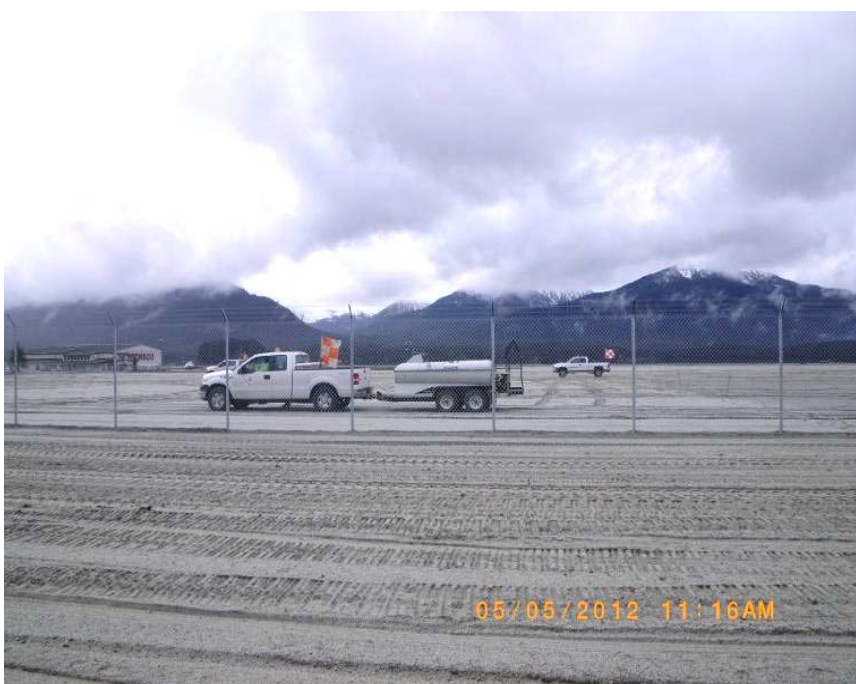
This image, taken on May 5, shows the dust palliative operation underway in the N.E. Development Area. The picture was taken from Yandukin Drive looking south. Temsco is visible in the distance to the left.