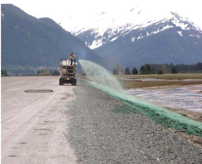
This image, taken on May 20, shows the hydro-seeding operation along the south RSA. The picture was taken about half way between the Jordan Creek culvert and the east end of the extended RSA. The view is to the east.