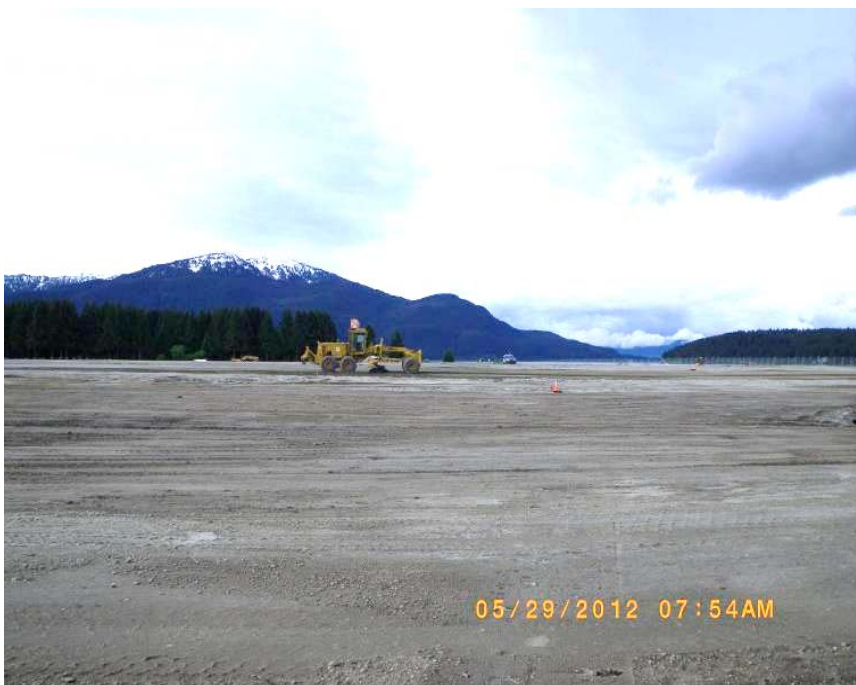
This image, taken on May 29, shows final grading underway at the west RSA. The EVAR and the Mendenhall River are to the right and the float pond is in the distance, extending to the left.