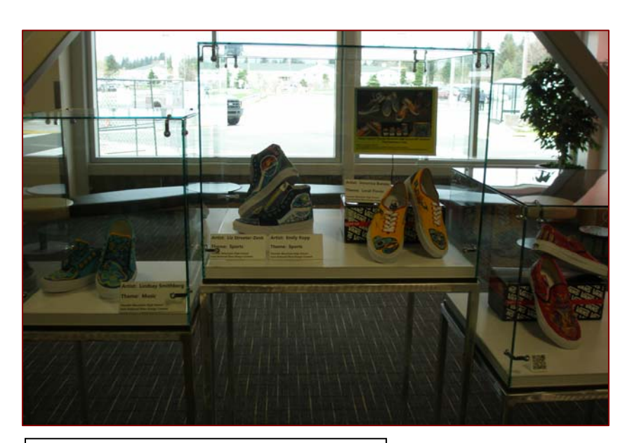
Art Exhibit in Baggage Claim Area.