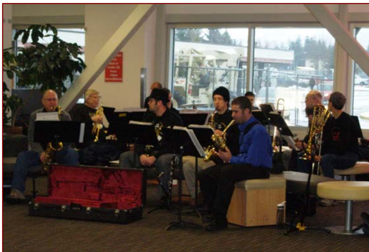
Thunder Mountain Big Band entertains travelers on Feb 20, 2012.

Production of construction documents for the SREF continues. The Sitework Infrastructure project is being prepared for Spring 2012 bidding. The AIP funding request was submitted to FAA in February, and staff continues to provide information and support for securing state funding for the project.