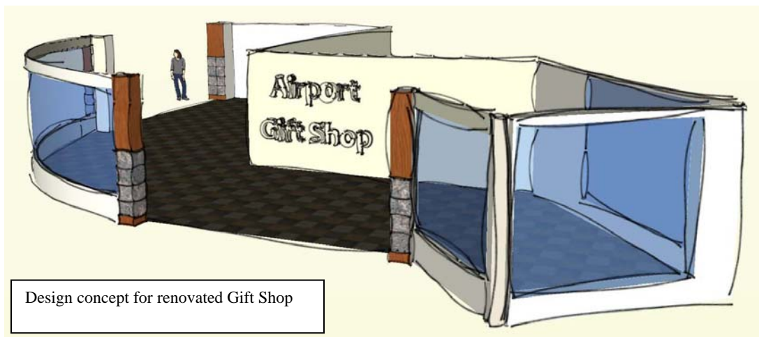
Design concept for renovated Gift Shop

Other projects around the terminal that occurred in November included completion of the new TSA bag screening equipment, tile trim in the Departure Lounge alcove, and installation of blinds in the Alaska Room.