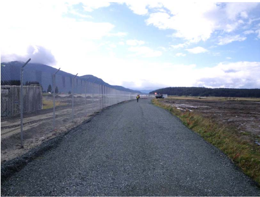
New 8' security fencing along west end of airport (paralleling the EVAR).