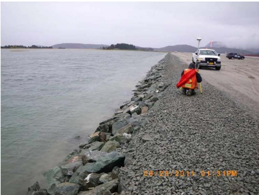
Edge of RSA along south side of airport, complete with 2" crushed rock along edge to control erosion during rain events.