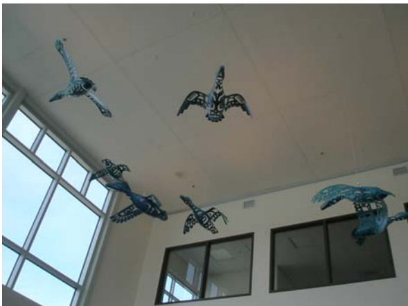
Ducks hang in 2-story gathering area.

The record documents and project files are getting a lot of attention now. There are many requirements for project closeout that must be met by the Contractor. Training on the heat pumps is scheduled for June 7-8, Operations & Maintenance Manuals are being developed, and a process for exercising warranty services is being developed.