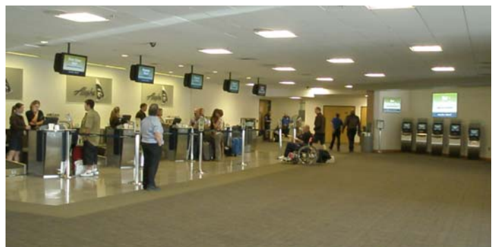
Completed Check-In lobby.