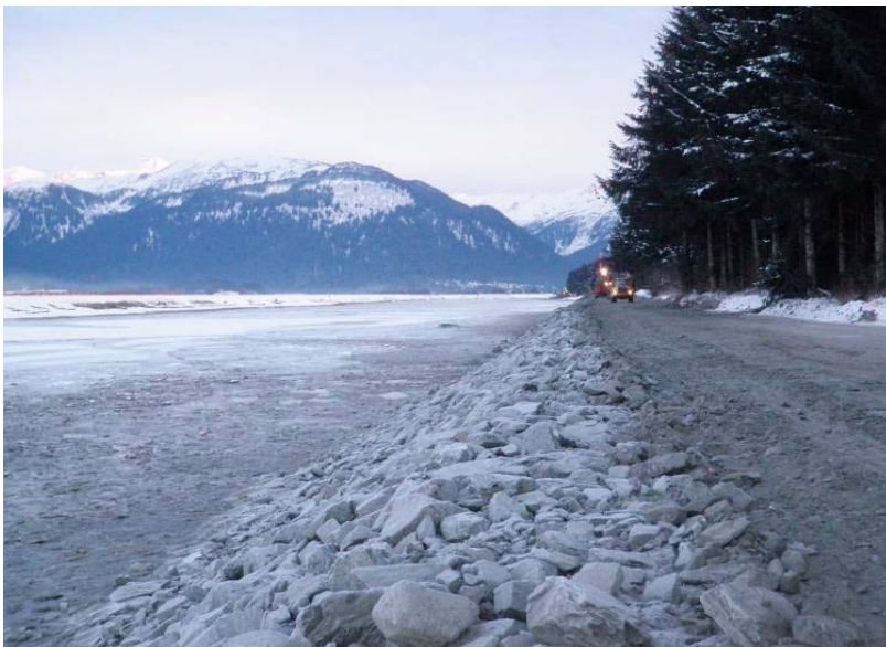
Rip rap reinforcement at top of steepened shore, SW portion of pond. Note level of pond