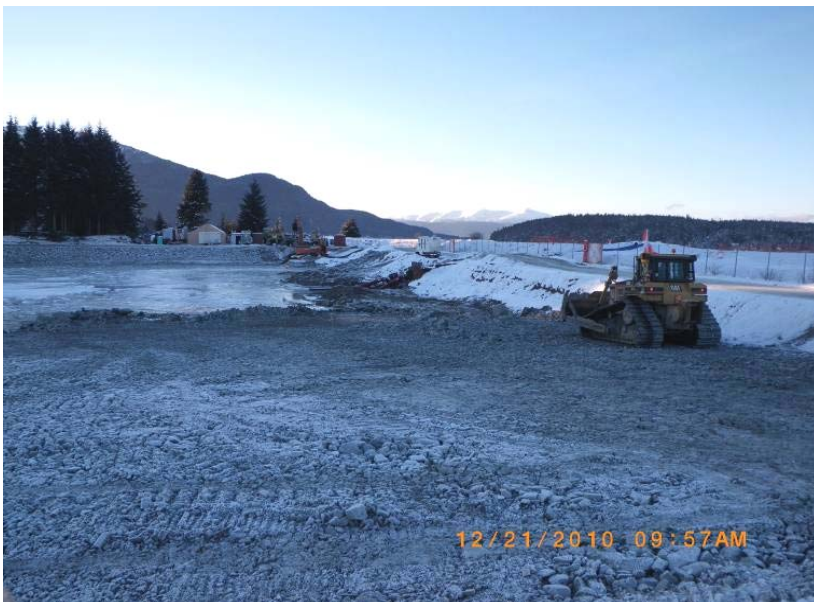
Initial work on new float plane launch ramp at NW corner of pond.