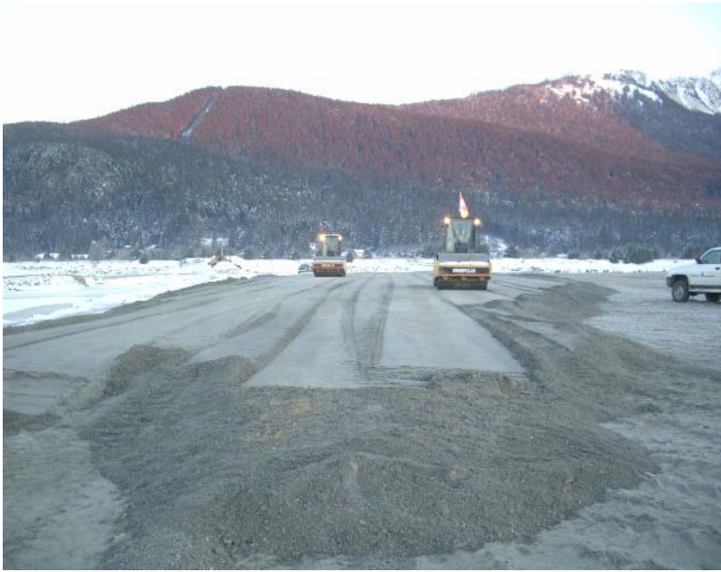
Cold weather placement of borrow at East RSA.