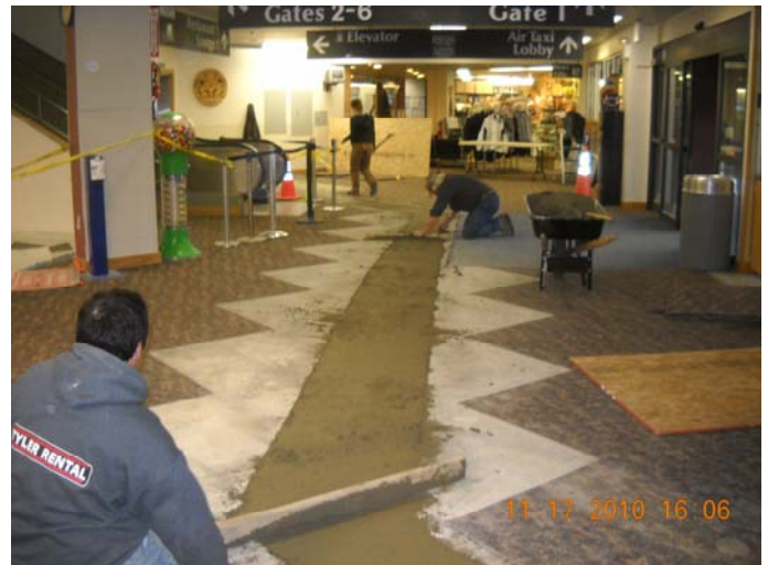
New underground waste line extended to accommodate new plumbing drain lines from Lounge above.