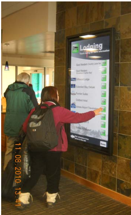
New digital display board for lodging, food, etc.