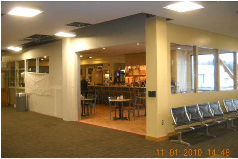
New opening into Lounge invites people to stop in.