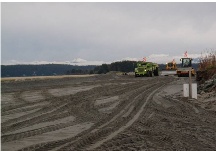
Truck haul to SE RSA