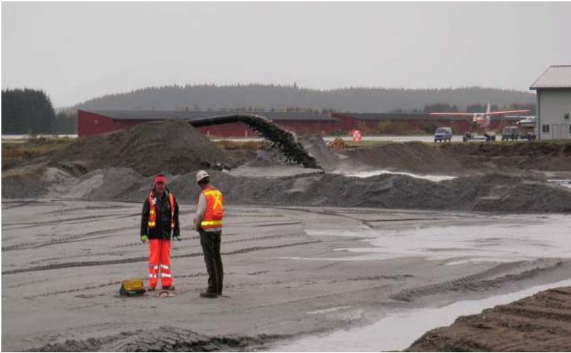
Dredge discharge to NE Development Area