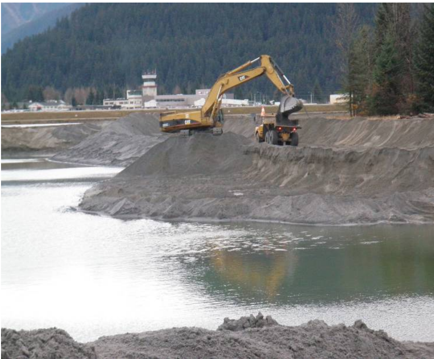
Mechanical excavation from West Finger