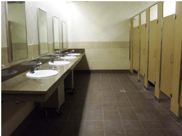
New restrooms opened in the Departure Lounge