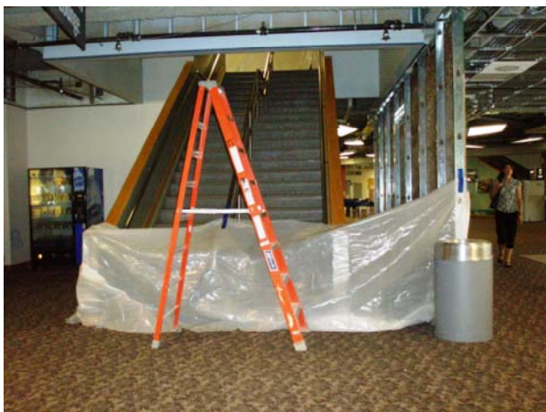
Demolition of the old stairway begins.