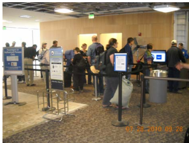
Temporary queue set-up at TSA passenger screening