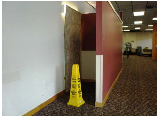
Old restrooms closed for demolition.