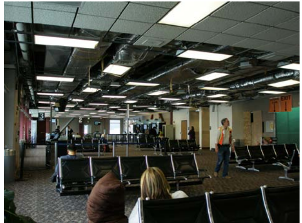
Mechanical work begins in the Departure Lounge