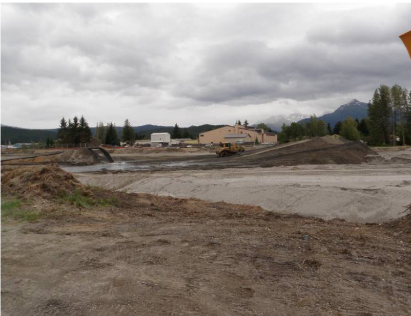
Dredge discharge, NW Development Area