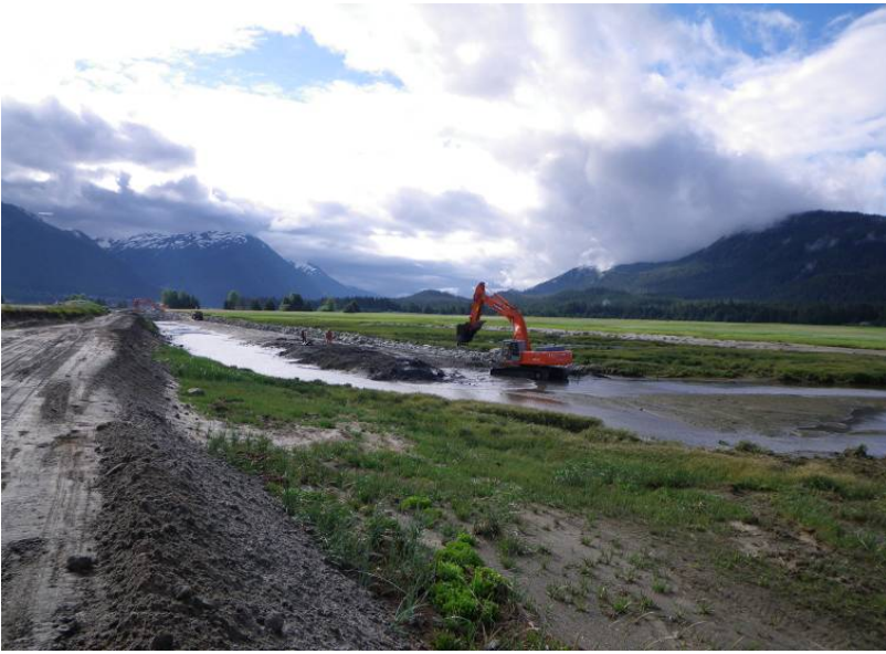
RSA toe slope and riprap construction, south RSA