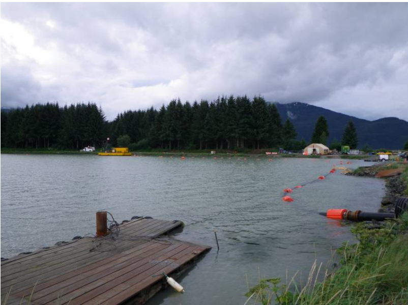
Dredge and discharge pipe, late June 2010