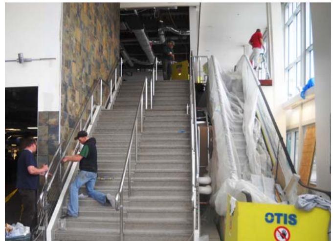
Attaching guardrail system to new stairs.