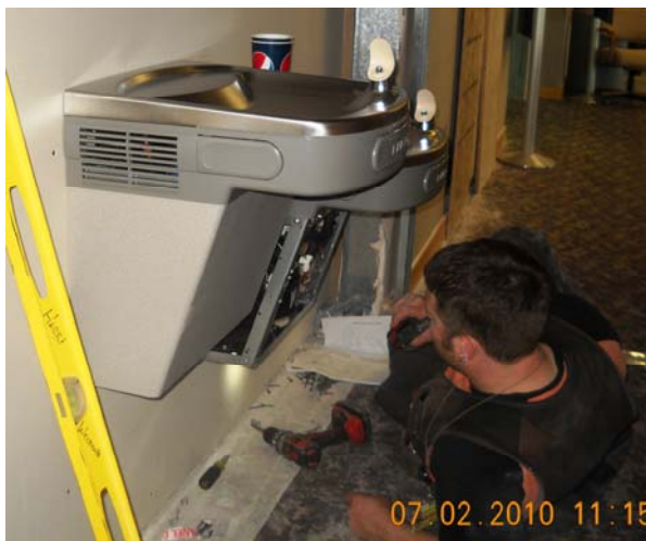
Installing new drinking fountains in Departure Lounge.