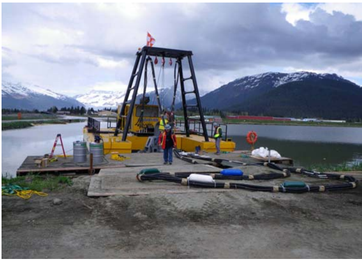
Fully assembled dredge