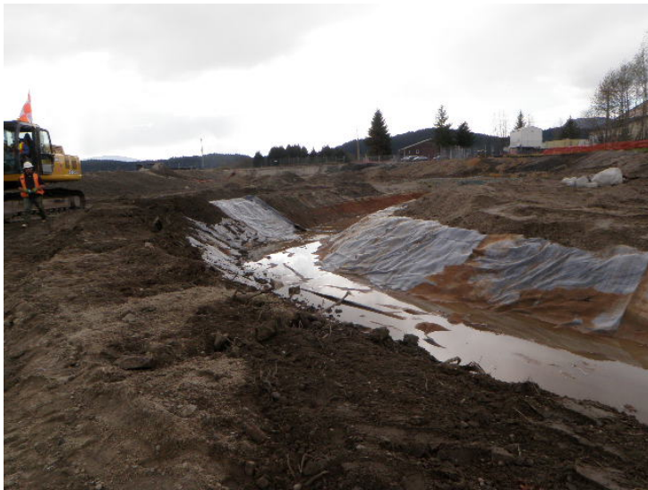
Bentomat liner in Duck Creek