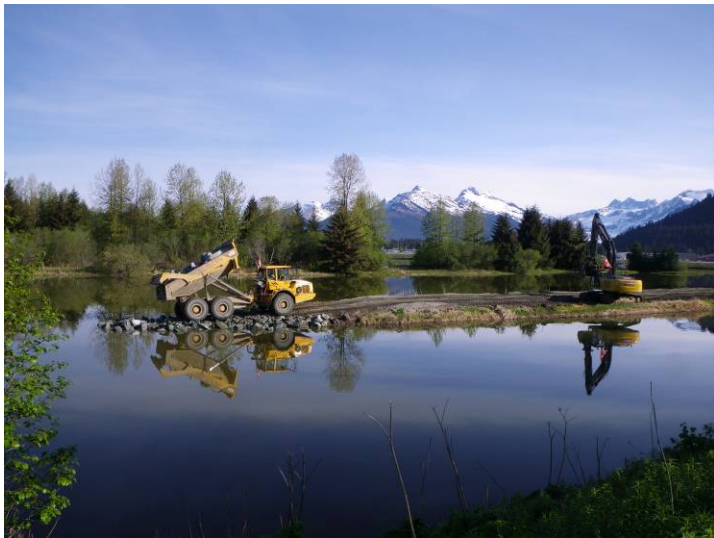
East finger road work