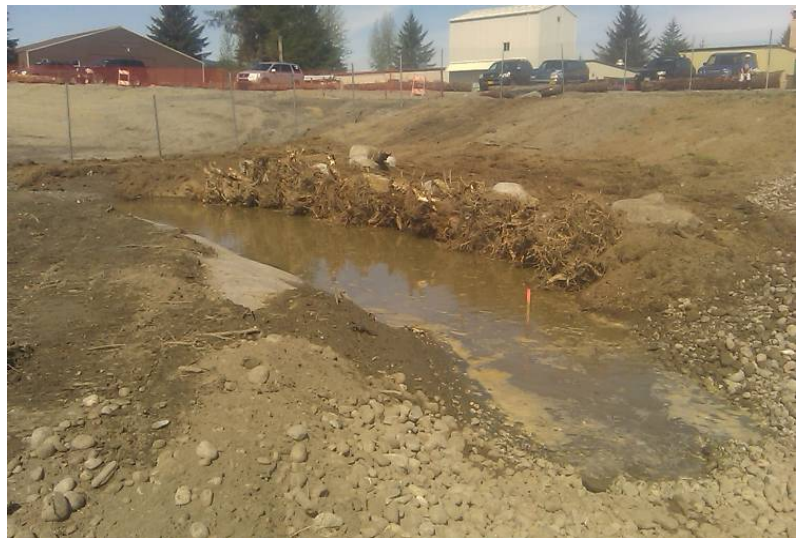
Duck Creek channel root wad installation