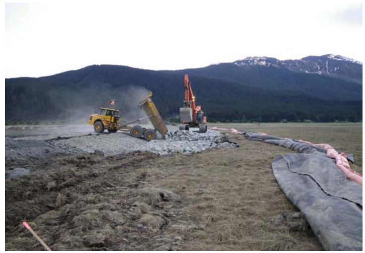
East end RSA apron construction