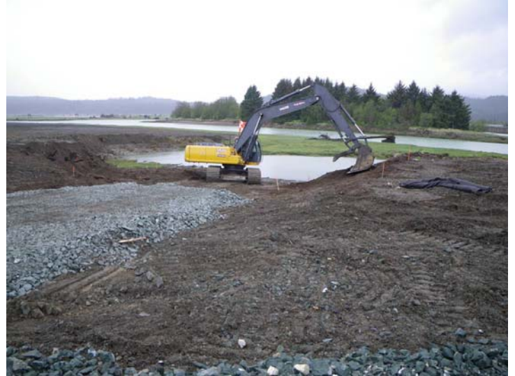
New ramp at Mendenhall River