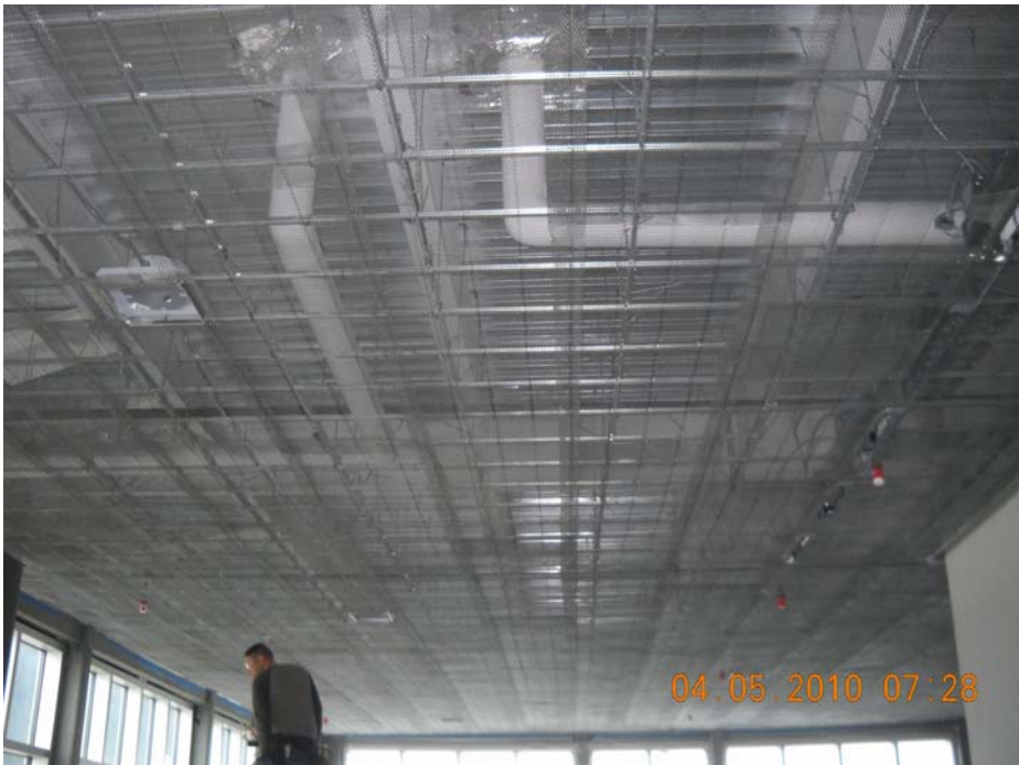
Plaster ceiling framing.