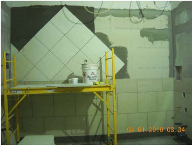
Tile installation in second floor toilet rooms.