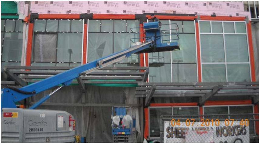
Installing glazing along front façade.