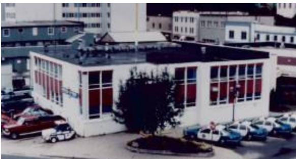
January 2, 1994 – On the heels of numerous problems with the building that housed JPD, a proposal was made to build a new public safety facility that would house JPD, DPS, and the Alaska National Guard.