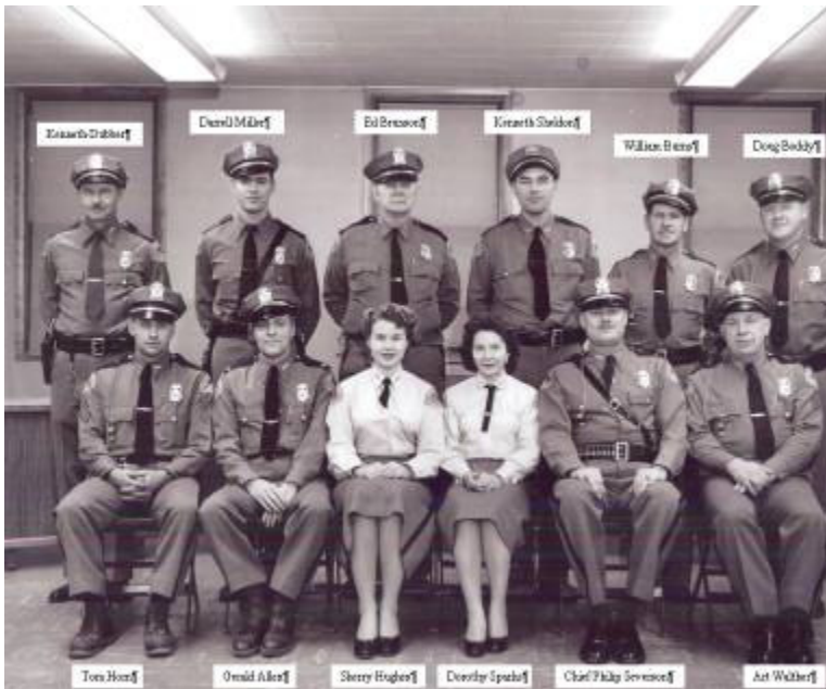
JPD - 1960

January 31, 1960 – A meter maid was hired to replace Officer Dull who requested a leave of absence.