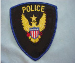
JPD Shoulder Patch 1960-1963