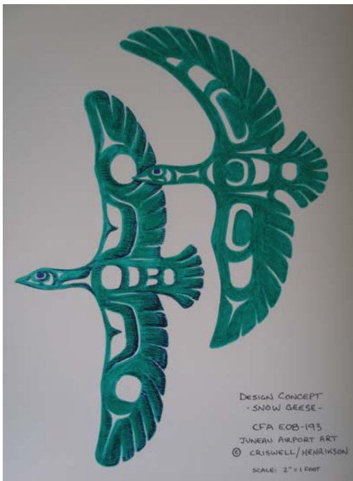
Sketch of one proposed bird in the art concept by Criswell & Henrickson.

Action Requested: That the Juneau International Airport Board accept the proposal for public art offered by Criswell and Henrickson, and recommend the concept approval to the CBJ Assembly. Further, it is recommended that the Airport Architect negotiate the specific terms of the art contract, including integration of the proposed art with the architecture for the new addition to the airport terminal.