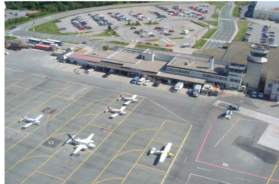
3 WELL FIELD LOCATION - COMMUTER / AIR TAXI PARKING