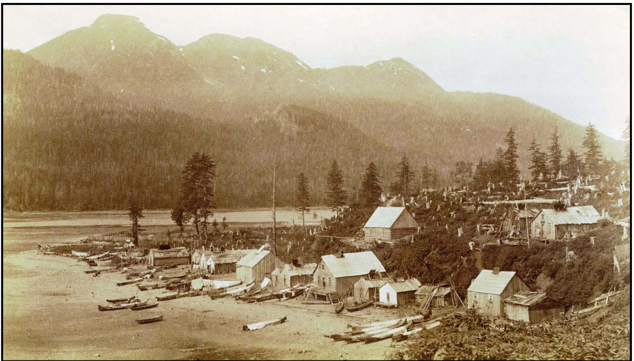
Auk Nu Indian Village, 1887. Present day Willoughby Ave is along the shoreline.

The Willoughby District was the open waters of Gastineau Channel until about 120 years ago. The shoreline was the bluff that now runs behind Village Street. For years this area was the site of seasonal fishing camps of the Auk Nu Tlingits whose primary winter village was located north of Juneau near what is now called Auke Bay. The Tlingit name for the Willoughby area was Dzántik'i Héeni ( river where the flounders gather ). These seasonal fishing camps were the main use of the area until western expansion brought prospectors at the end of the 19th century.