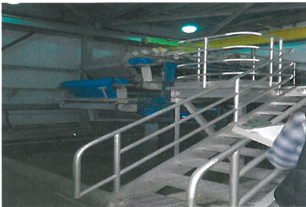
Belt Filter Press