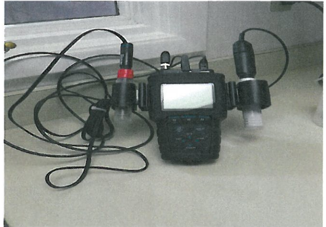
Orion pH and DO Meter