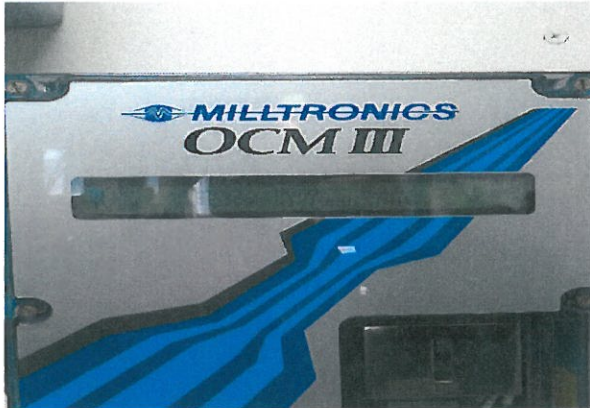
Milltronics Flow Meter