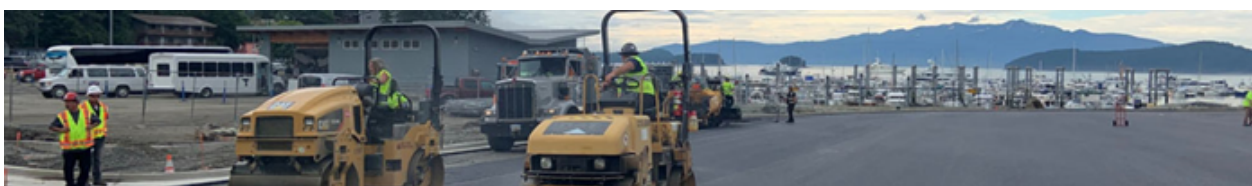
Dawson Construction working on paving for Statter Harbor Phase IIID

Statter Harbor Phase IIID Update: Statter Harbor Phase IIID. Dawson Construction continues to make great progress in the project to add curb, gutter, lighting, landscaping and paving. Paving for additional truck and trailer parking spots were finished before Salmon Derby Weekend. Dawson is on schedule to have the lot repaved by October.