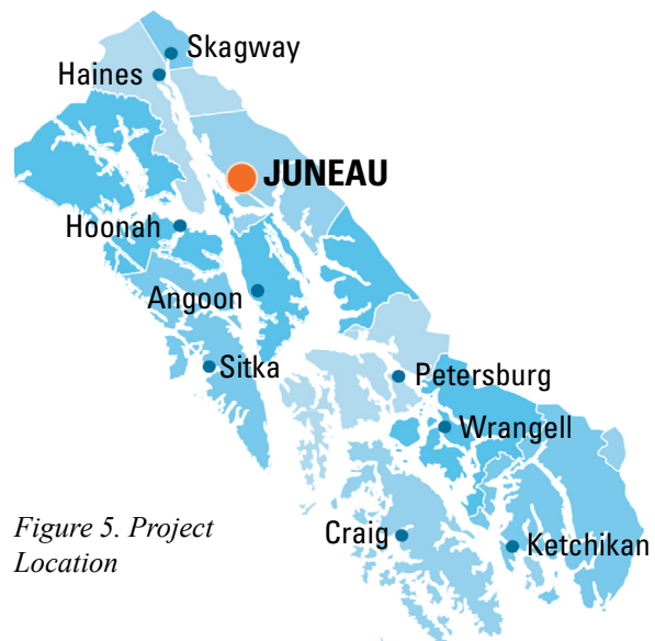
Figure 5. Project Location

The Aurora Harbor Drive Down Float Project will be constructed near downtown Juneau, between Aurora and Harris coastal harbors at 58°18’12.18” North and 134°25’56.11” West. CBJ acknowledges and respects that our community is built on the ancestral lands of the