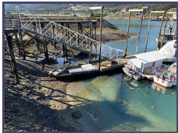
Figure 7. Project site: Steep Gangway

The drive down float will allow harbor users to drive transportation vehicles down to the float, where they can use the two additional five-ton cranes to transport goods and supplies directly from the vessels to vehicles. By removing the need for harbor users to walk the steep ramps and carry goods by hand, a drive down crane float would eliminate nearly 17,000 hours of walking back and forth between vehicles and vessels annually and 250 injuries over the next 30 years. The value of injuries and accidents avoided benefit, based on damage costs provided by the US DOT, is $41 million discounted over a 30-year period. Additionally, replacing the existing fixed dock with a floating dock will provide a safer option for the large tidal swings of up to 25 feet that occur. In these environments, floating