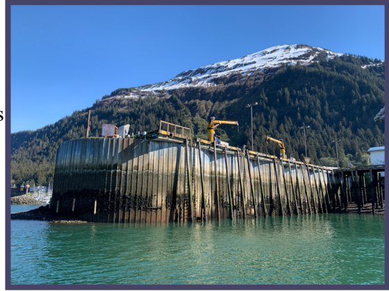
Figure 3. 27-foot Ladder from vessels to existing Crane Dock

The Aurora Harbor Drive Down Float project is the first step toward addressing numerous basic transportation challenges, including safety, congestion, mobility of goods, and vessel moorage in a manner that best protects the environment and public space. These challenges are rooted in the lack