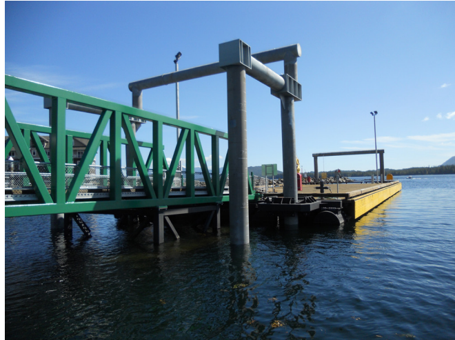
Figure 4. Similar Project: Ketchikan Drive Down Float

A proposed drive down facility is intended to be situated just inside the southern entrance of the Aurora Harbor, with the objective of providing seamless operations for vessel loading and offloading activities. The facility will comprise a vehicular transfer bridge measuring 17 feet in width and 140 feet in length, which will be connected to the shore at the northwest corner through a widened dock section measuring 60 by 70 feet. The dock section will be linked to the existing pile-supported approach dock. The bridge will provide access to a vehicle-accessible drive down float