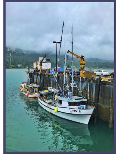
Figure 9. Crane dock in use

Harbor users reported using the crane dock to be cumbersome and difficult for transferring freight goods. Many users additionally note that the crane dock can be difficult to navigate to due to a tight turning basin radius combined with the strong, swirling currents present there. Docking at the crane dock becomes especially difficult when another boat is already moored to it, despite the crane dock being meant for more than one vessel.