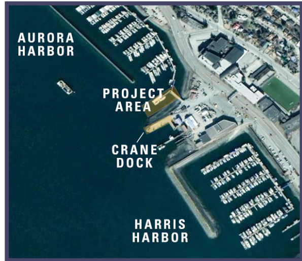
Figure 6. Project site

According to the Climate and Economic Justice Screening Tool, the project is not designated as a Historically Disadvantaged Community but is designated as health disadvantaged in terms of low life expectancy and climate change disadvantage in terms of projected flood risk. While the project is not located in a historically disadvantaged community it is a regional hub for many historically disadvantaged communities in Southeast Alaska. Juneau is not located in a federally designated community development zone. The Census Tract has a population of approximately 5,380 residents, according to the Climate and Economic Justice Screening Tool. The tool notes the population within the tract is 2% Black or African American, 23% Alaskan Native, 12% Asian, and 3% other. While the percentile of the low-income population is in the 61st percentile.