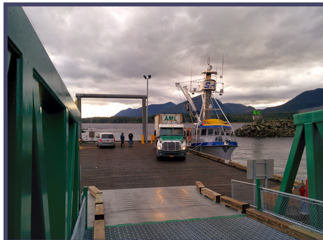
Figure 8. Similar Drive Down Float Transferring Freight Directly from Vessel to Shipping Container

There is no road access to Juneau and many other nearby Southeast Alaska communities, many of which rely on Juneau for access to the above freight resources. Reliable movement of these goods is critical to the local and regional community. The drive down ramp and new cranes will allow operators to drive containers directly to vessels for loading. Fresh seafood and freight can be transferred without intermediate freight hauling stages. The proposed project will additionally free up space at the crane dock. This additional reliable method of freight transfer is expected to increase the freight products moved by hundreds of thousands of pounds each year.