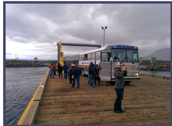
Figure 10. Example of similar drive down float transporting people by bus