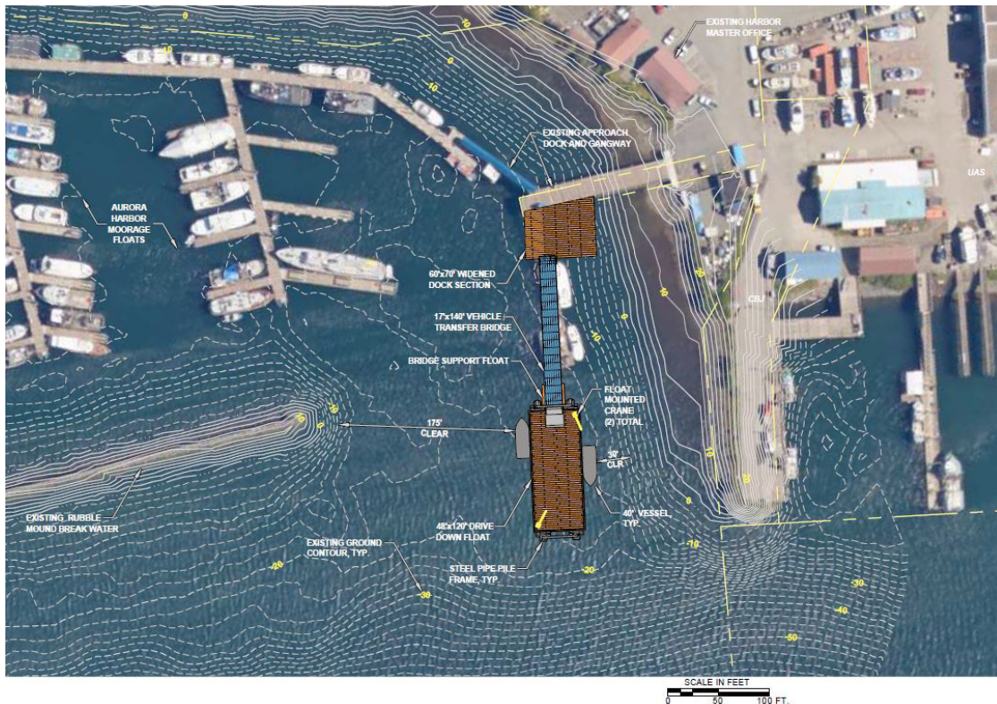
Figure 2. Excerpt from engineering drawing

The proposed project will offer year-round, all-tide ability for loading and unloading gear, cargo, provisions, seafood, and other related items. Its implementation will significantly improve the safety and efficiency of these operations by providing direct access between vessels moored to the float and the shore through a vehicle transfer bridge. The project aims to tackle overcrowding and ensure timely loading operations for commercial fishing and other vessels.