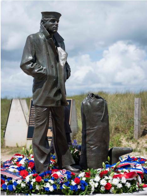
The Lone Sailor Statue in Normandy, France.