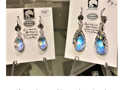
Above: Swarovski crystal earrings by Thyes Shaub.

Our jewelry case features beautiful pieces from local artists, made in many different styles and materials. Thyes Shaub's glittering crystals always make for a special gift with their shine and elegance. Miah Lager's earrings combine upcycled fur and leather in unique color combos to add some fun to every fashionable day. AK Mountaintop Mermaid is our newest addition, featuring locally scavenged blue mussel and urchin shells, as well as local quartz, in electroformed copper settings. To go with our summer exhibition we have Lily Hope earrings in multiple colors, check out the dynamic enamel Chilkat faces, or the hand-woven Ravenstail earrings. We also carry a selection of earrings from Trickster Co. - grab a pair along with a deck of Trickster playing cards for a perfect present.